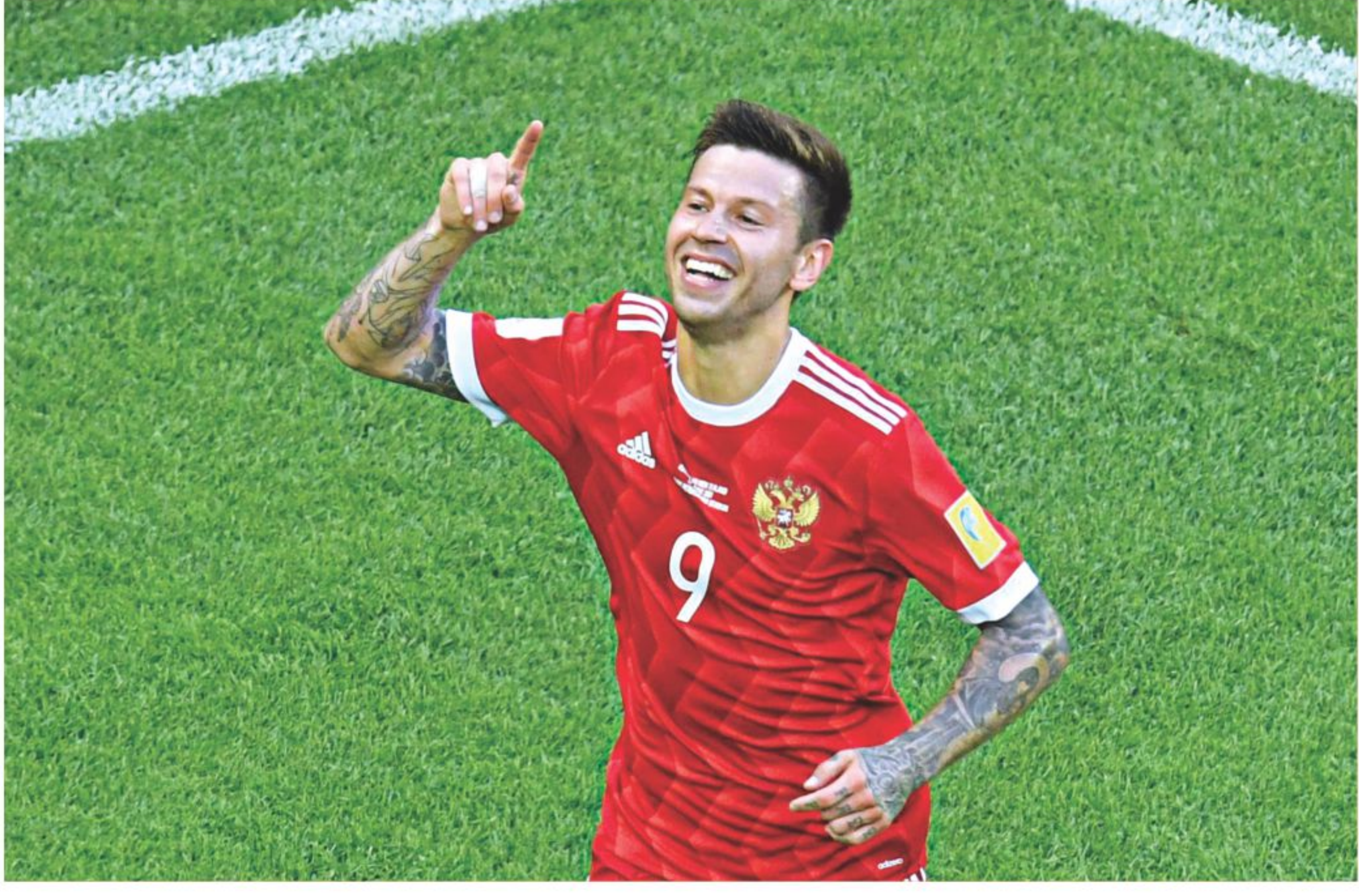
Russia forward Fedor Smolov celebrates after scoring the second goal against New Zealand during their 2017 Confederations Cup group A match at the Krestovsky Stadium in Saint-Petersburg yesterday.

Cherchesov's men were too strong for a limited New Zealand side and were unlucky not to take an early lead, Viktor Vasin heading against the post from an Alexander Samedov corner, with Michael McGlinchey