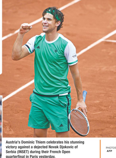
Austria's Dominic Thiem celebrates his stunning victory against a defeated Novak Djokovic of Serbia (INSET) during their French Open quarterfinal in Paris yesterday.