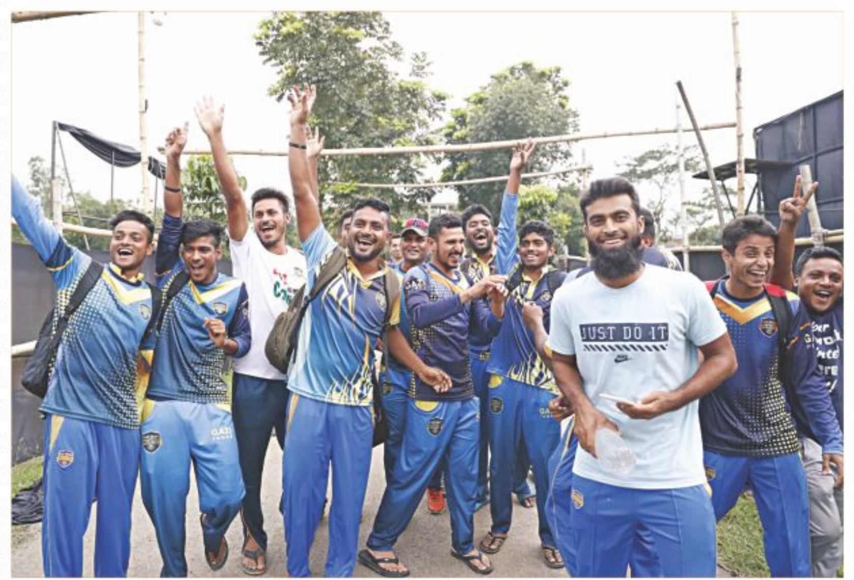
Gazi Group Cricketers celebrate their title win in the Dhaka Premier League at the BKSP yesterday.