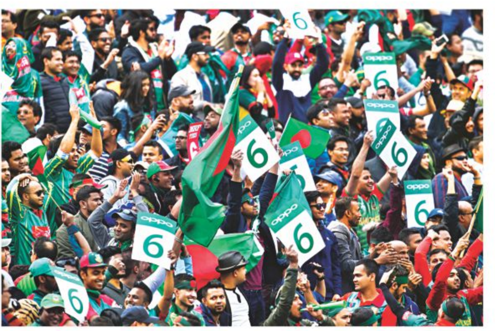
Bangladesh supporters were in numbers and in full voice, as always, at The Oval in London yesterday.