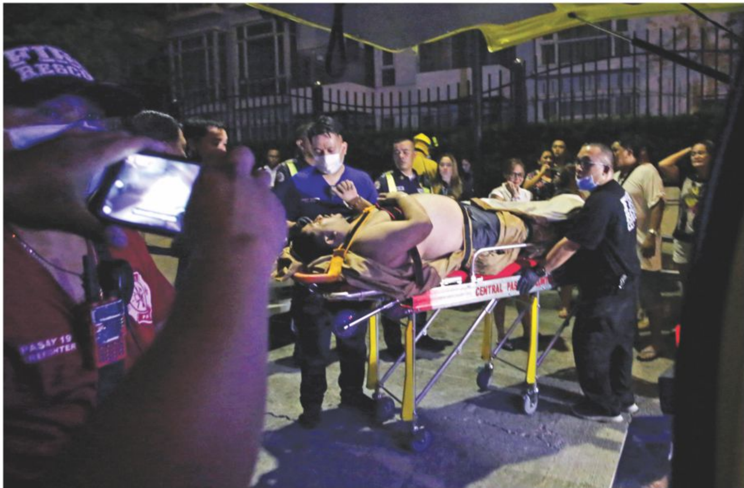
An injured hotel guest is seen outside of a hotel after a shooting incident inside Resorts World Manila in Pasay City, Metro Manila, Philippines yesterday.