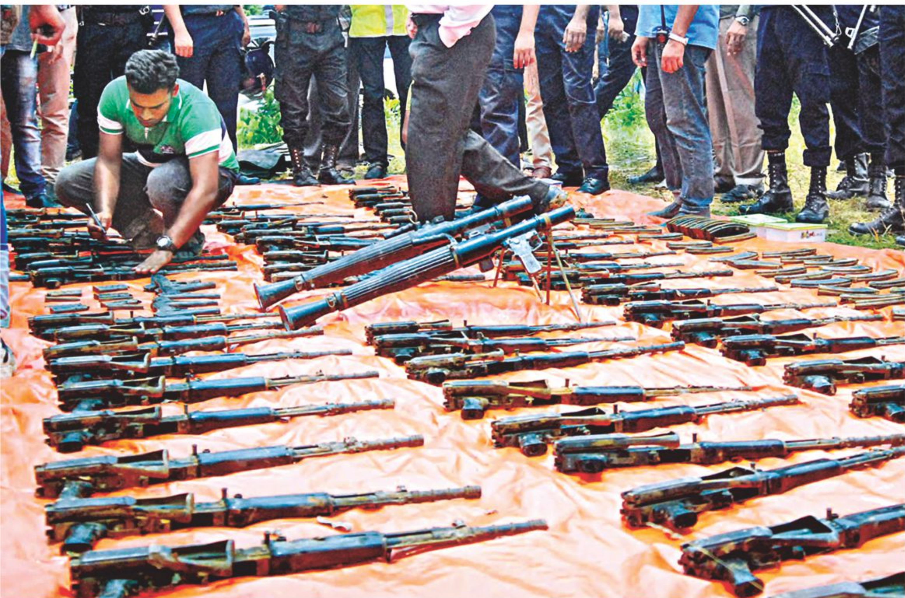
Firearms and ammunition recovered by police are on display in Narayanganj's Rugganj yesterday. Two rocket launchers and 61 Chinese submachine guns are among the arms.