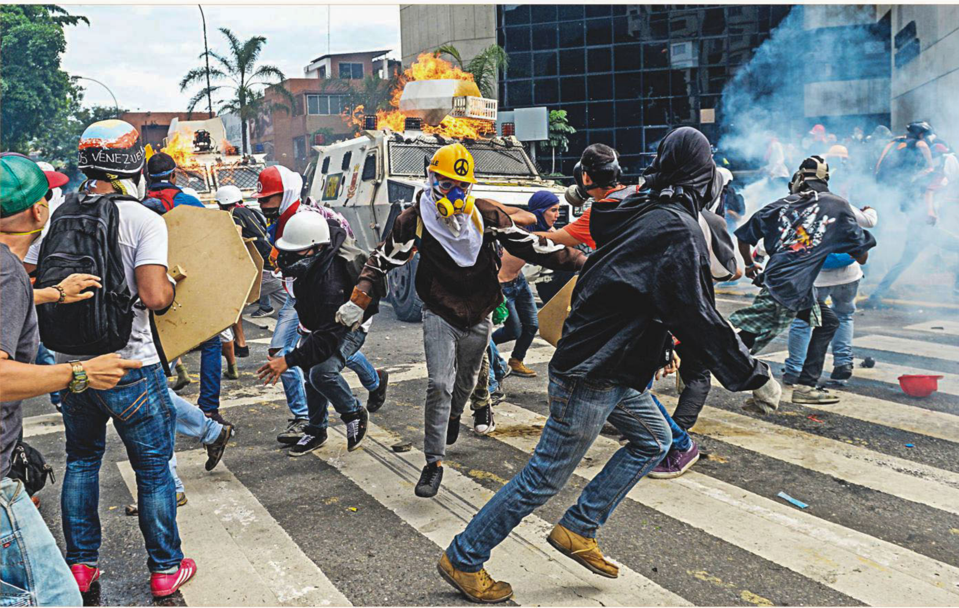
Demonstrators clash with police during a protest against Venezuelan President Nicolas Maduro, in Caracas, Wednesday. Anti-government protests raged on in Venezuela yesterday after a day of clashes brought the death toll to 32.