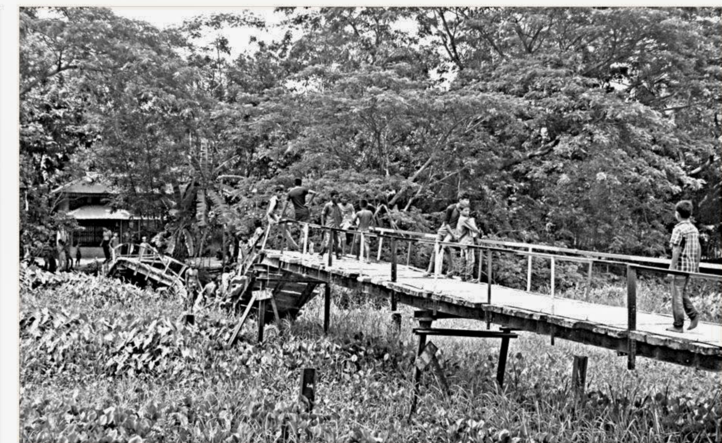
Merely five months of its repair work, this iron-structure bridge on Pankhali canal in Patuakhali's Galachipa upazila collapsed on Sunday.

Locals rescued the kid and took him to Shivalaya Upazila Health Complex, where the doctors declared the boy dead.