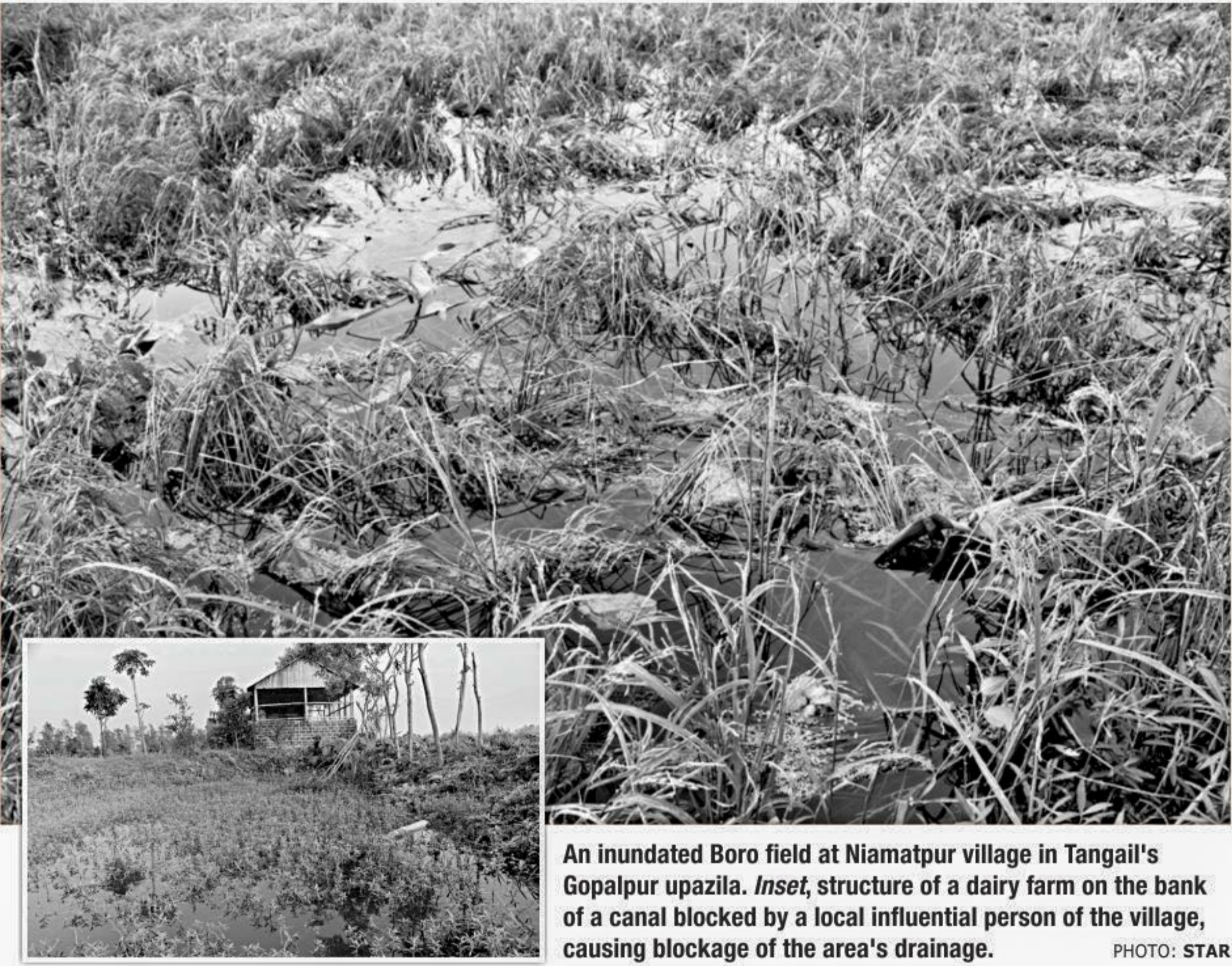
An inundated Boro field at Niamatpur village in Tangail's Gopalpur upazila. Inset, structure of a dairy farm on the bank of a canal blocked by a local influential person of the village, causing blockage of the area's drainage.