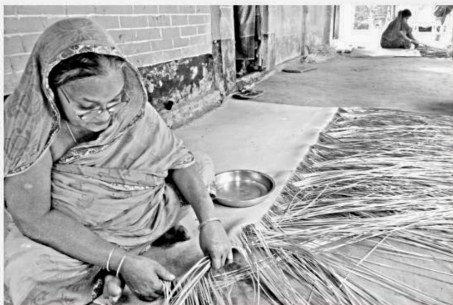
Two women weave shitol pati at their home at Napiterhat village in Rajapur upazila of Jhalakathi. The photo was taken recently.

M JAHIRUL ISLAM JEWEL, Jhalakathi The ongoing hot weather has brought blessings for the cool mat weavers at Napiterhat village in Rajapur upazila as the demand increases during this time. The children, girls and women are passing busy time in the upazila as summer is the peak season for selling the mats, locally called shitol pati. Shitol pati is weaved from stalks of the murta, a reed-like plant locally known as paitra, and is spread on the bed to keep the bed naturally cool. Five to ten days are needed to make a medium size pati, which costs around Tk 1,000 to Tk 2,500, said weaver Mala Rani Patigar. In the community, women are the main bread earners and the men assist them in making the mats, said Swapan Patigar, secretary of the Patigar Association of the area. About hundred families are involved in weaving shitol pati and their survival depends on