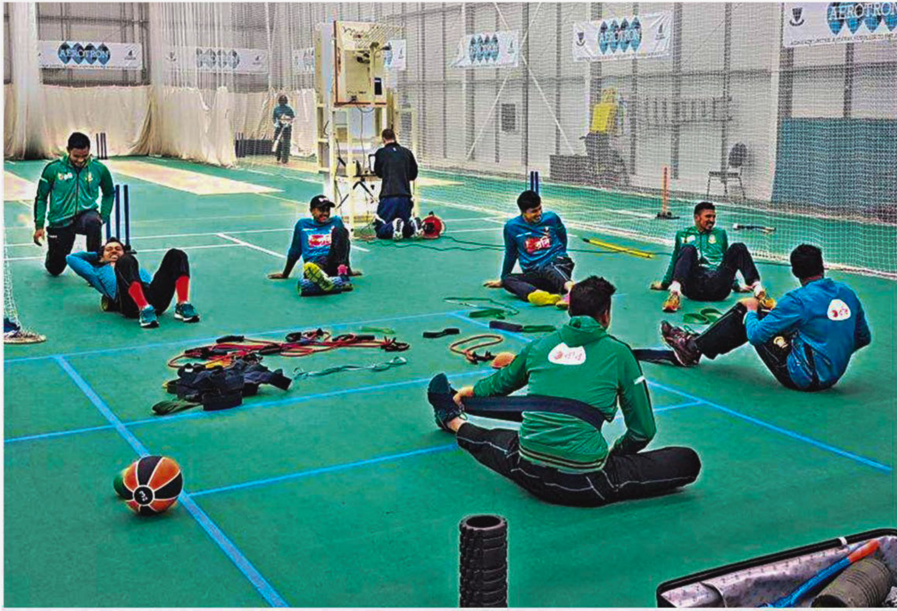
Tigers' do some light stretching ahead of their first practice session in Sussex yesterday. They have gone to Brighton for a 10-day camp to gear up ahead of a tri-nation series in Ireland and the Champions Trophy following that.