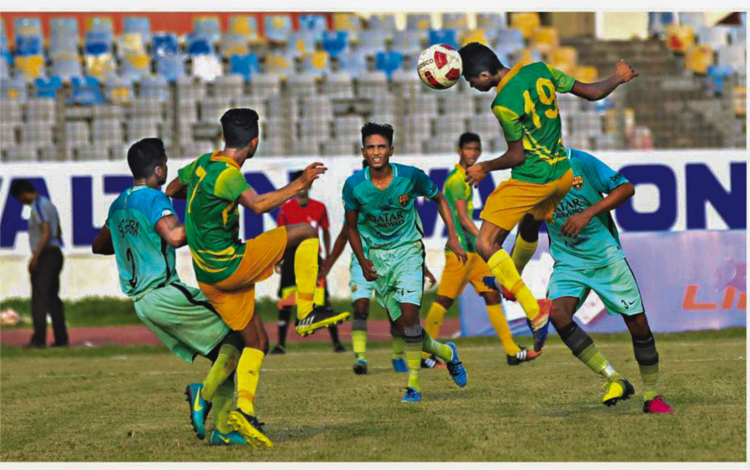
Satkhira (playing in green) had a chance to qualify from their group with an outright win, but a draw against Sylhet saw them eliminated from the U-18 National Football Championship at the Bangabandhu National Stadium yesterday.

Former Pakistan captain Shahid Afridi on Friday declined an offer by Pakistan Cricket Board (PCB) executive committee chairman Najam Sethi to give him a farewell upon his retirement from international cricket. Afridi took to Twitter to thank Sethi for meeting him last Sunday and offering to arrange a "fitting farewell". Afridi, however, declined to accept the farewell offer citing his 'commitments' and said his earlier desire for a farewell was just to "set a new trend".