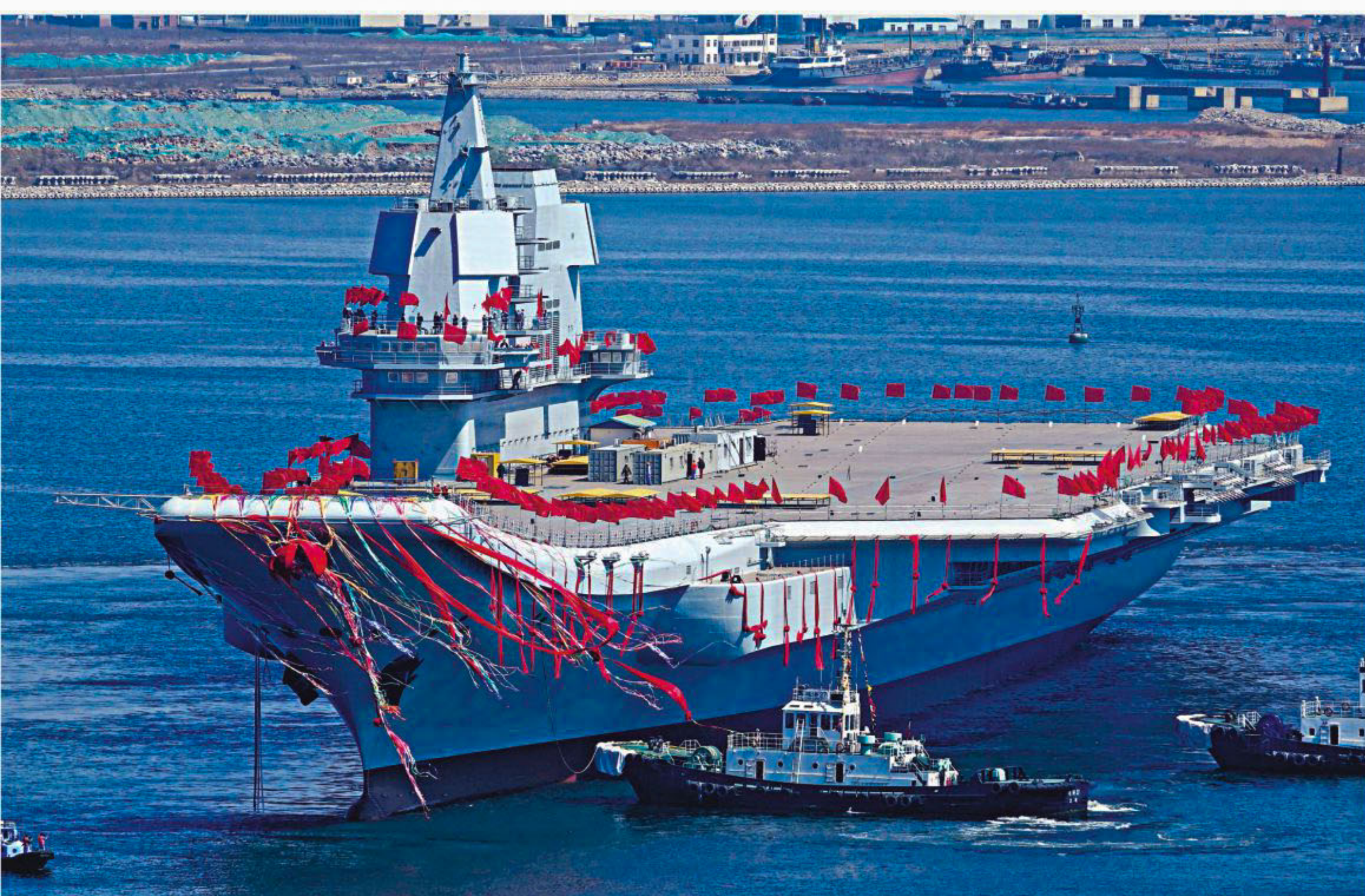
Type 001A, China's first domestically designed and built aircraft carrier, is seen during a launch ceremony at Dalian shipyard in Dalian, north-east China's Liaoning Province, yesterday.