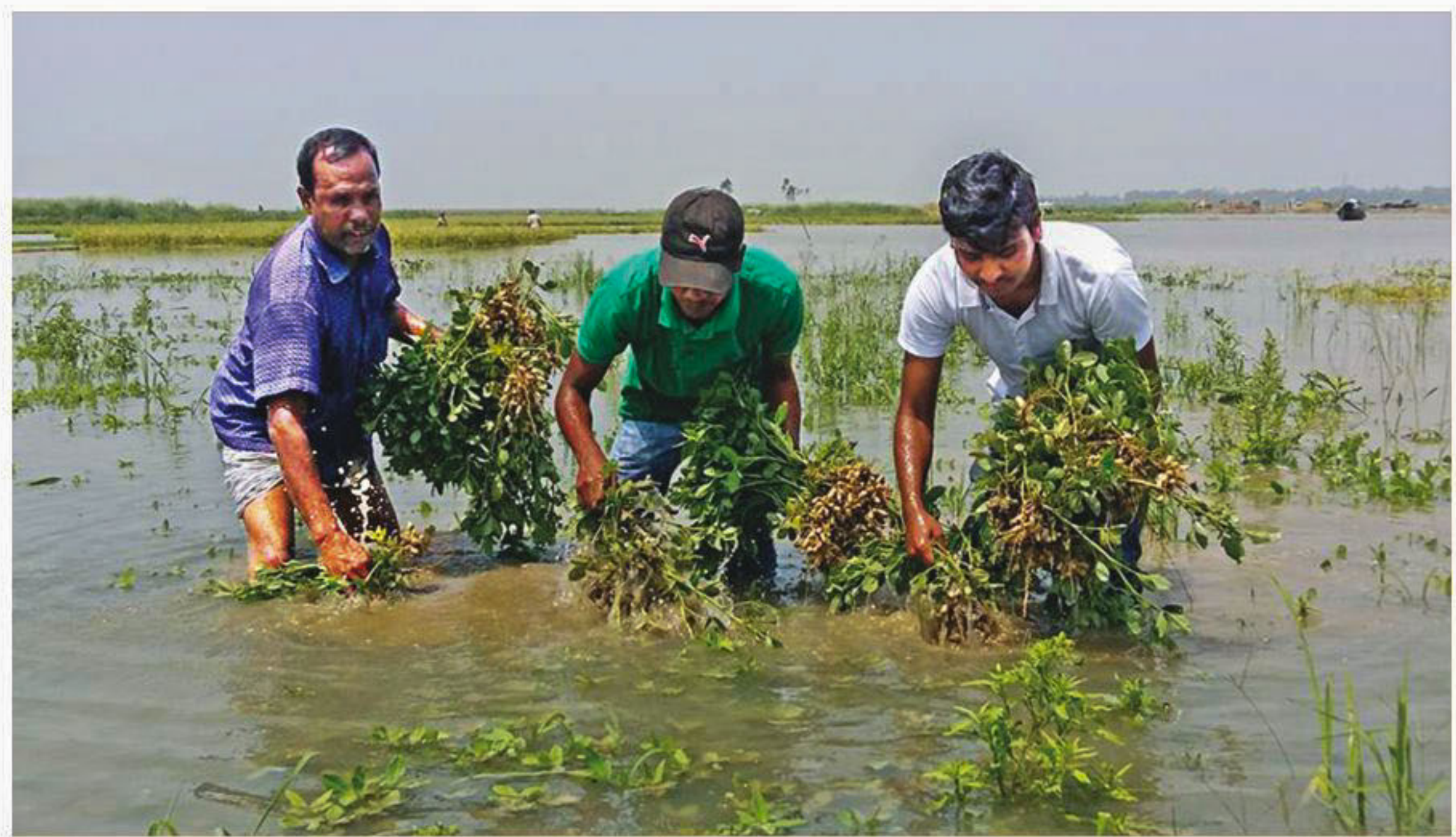
Farmers pull out their peanut plants in Chalan Beel yesterday after the beel went under water in an early flood, damaging crops on 1,500 hectares of land.