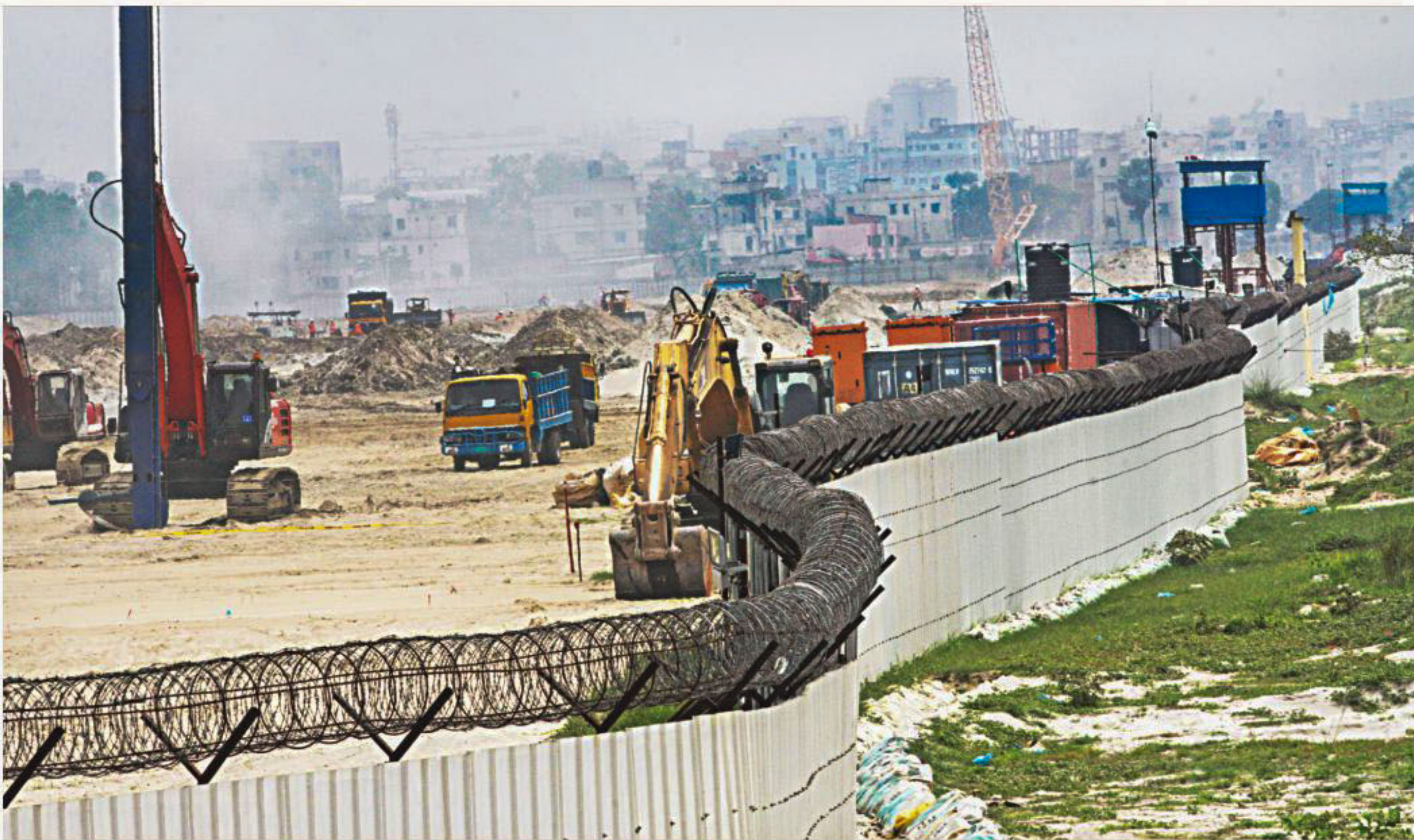
Land development work going on in the metro rail depot of north Uttara in the capital. Even though work on this component of the rail project has begun, final contracts for the other seven components have not been signed. The photo was taken recently.