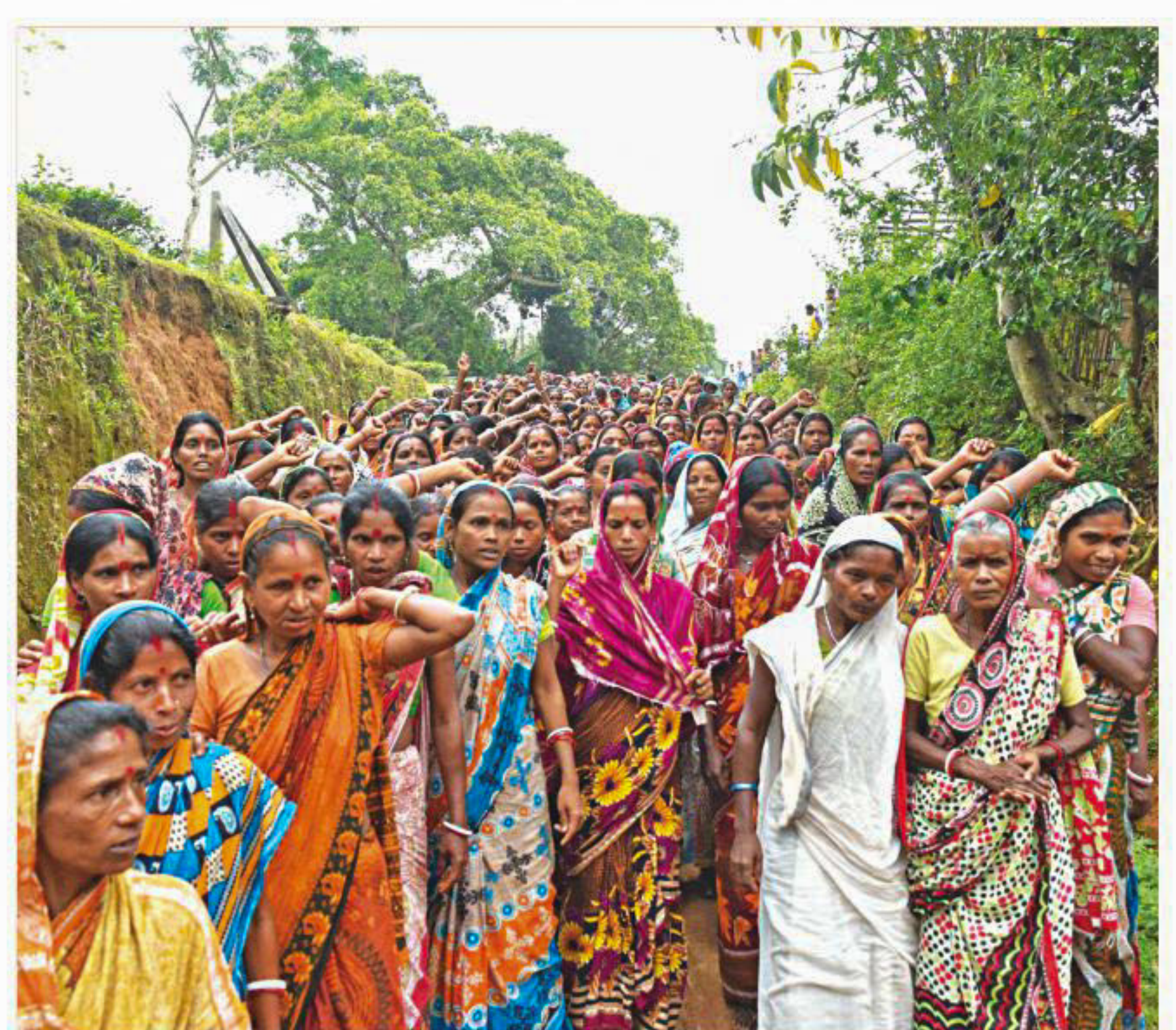
Workers of Chatlapur Tea Garden in Kulaura upazila of Moulvibazar bring out a procession demanding immediate repair of their houses that were damaged by recent storms and incessant rain.

He said more land would be needed for doctors' quarters, students' halls, mosque, playground, auditorium and laboratories, but the present campus does not have sufficient space for those.