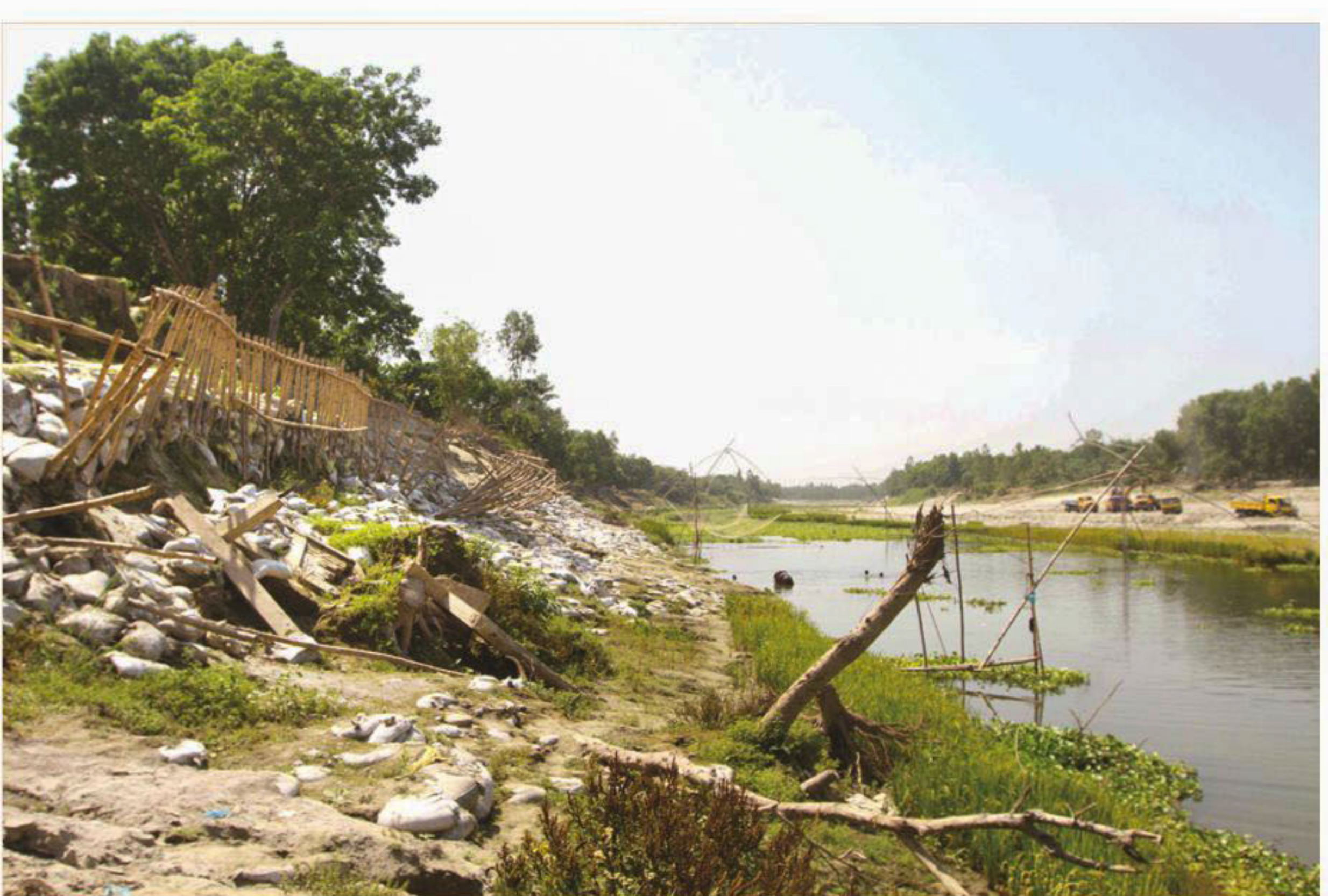
A section of local influential people continue earth extraction from the Elongjani river in Kalihati upazila of Tangail, causing erosion at Char Bhukta village.

"The upazila administration did not give permission to anyone to lift earth from the river. Necessary steps will be taken after investigation," he added.