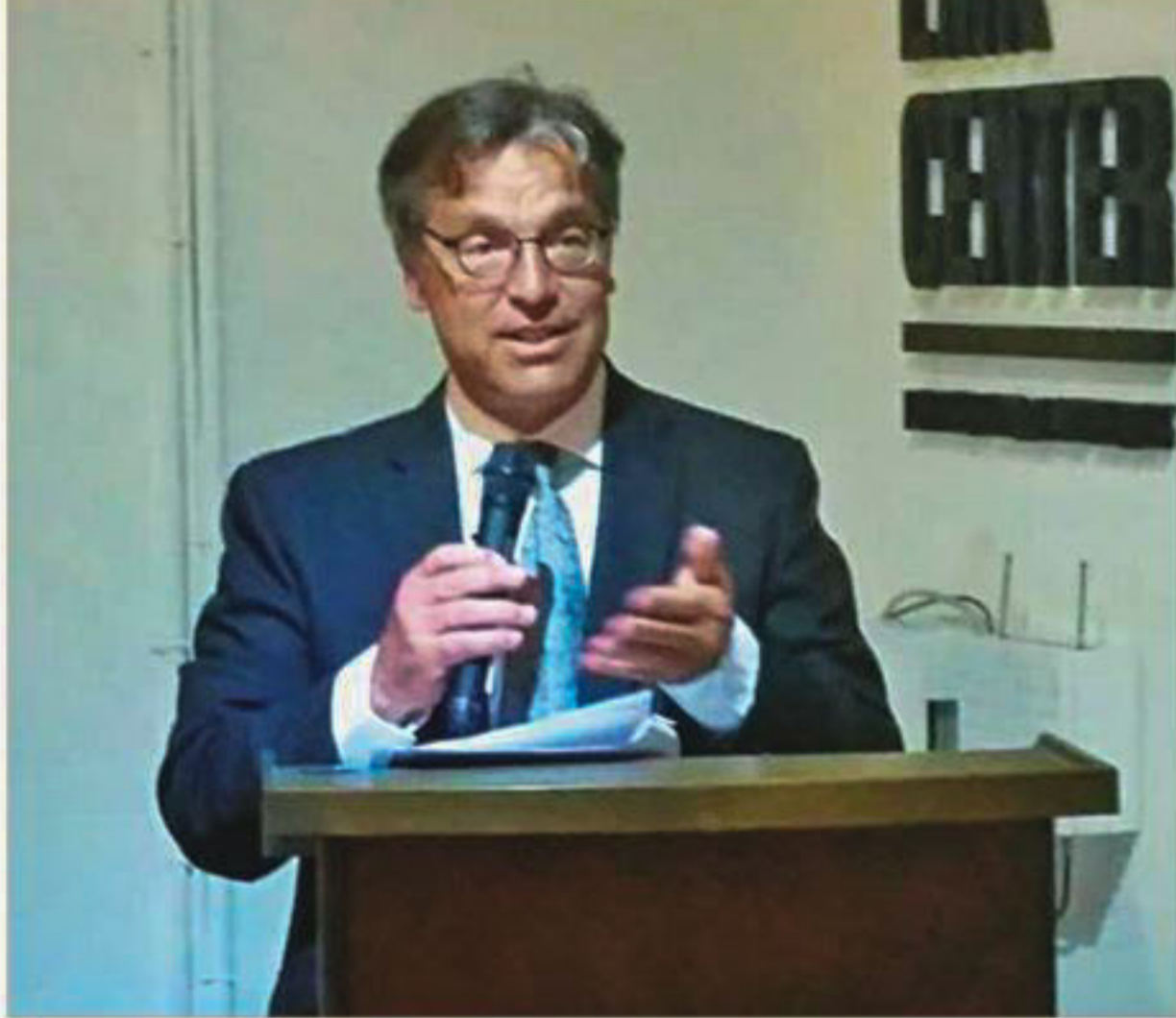
High Commissioner of Canada to Bangladesh Benoit-Pierre Laramée addresses the event.

"Alice Munro: Nirbachito Golpo" contains the translation of ten stories by the Canadian Nobel Laureate. All the translators are members of The Reading Circle and Gantha, a group of creative writers and translators.