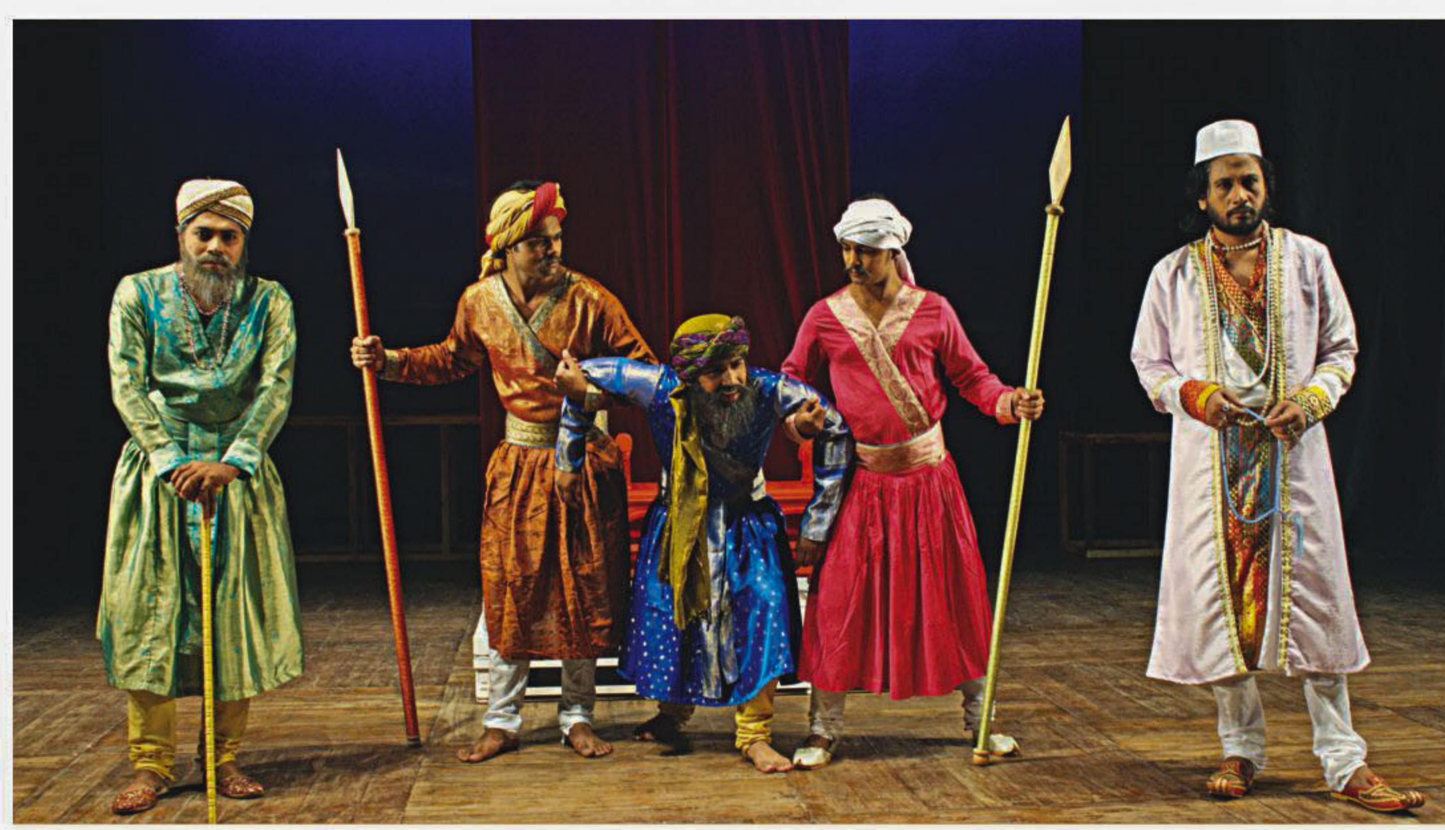
A scene from a play at the festival.