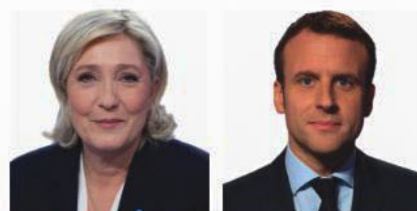
Marine Le Pen Emmanuel Macron