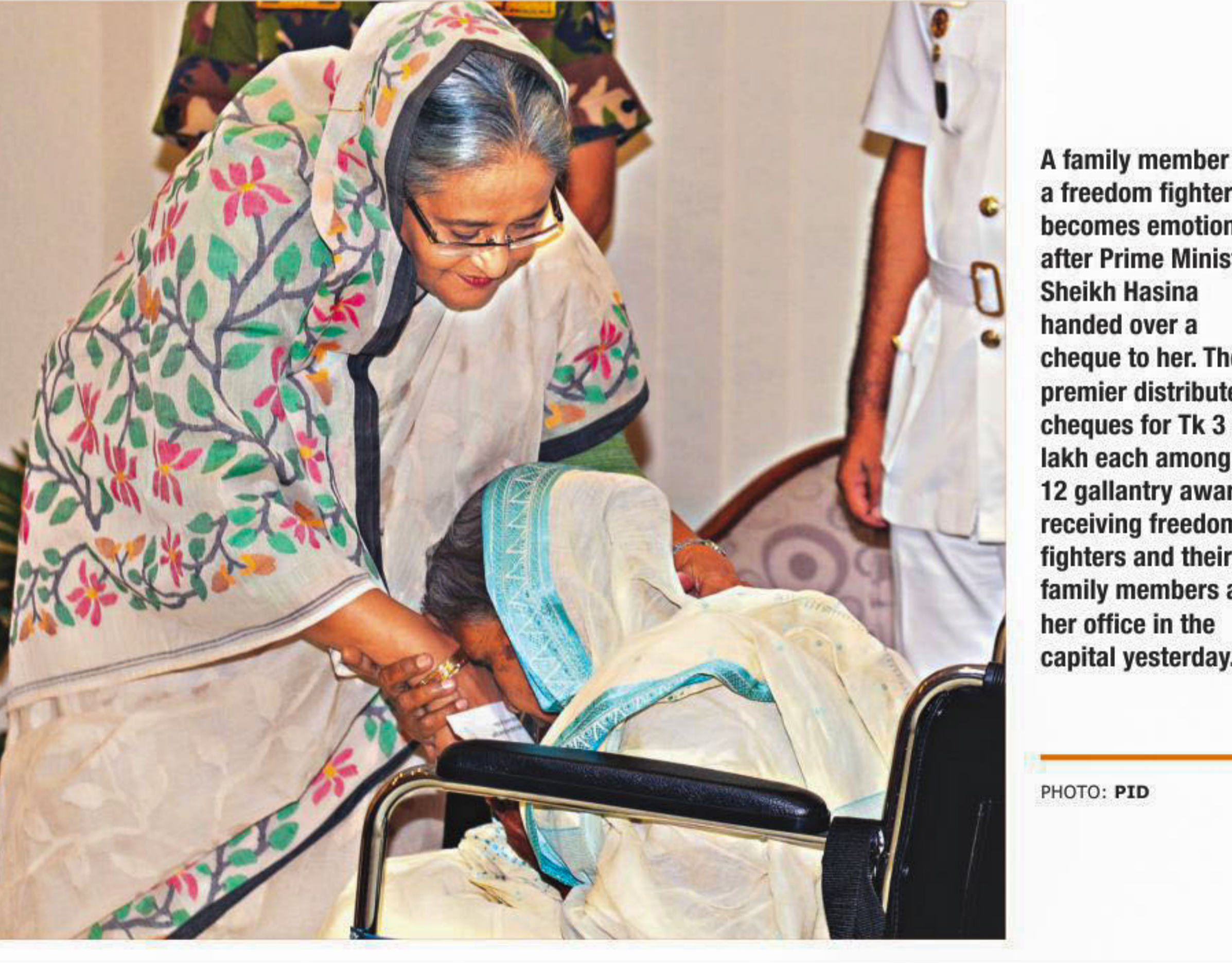
A family member of a freedom fighter becomes emotional after Prime Minister Sheikh Hasina handed over a cheque to her. The premier distributed cheques for Tk 3 lakh each among 12 gallantry award-receiving freedom fighters and their family members at her office in the capital yesterday.