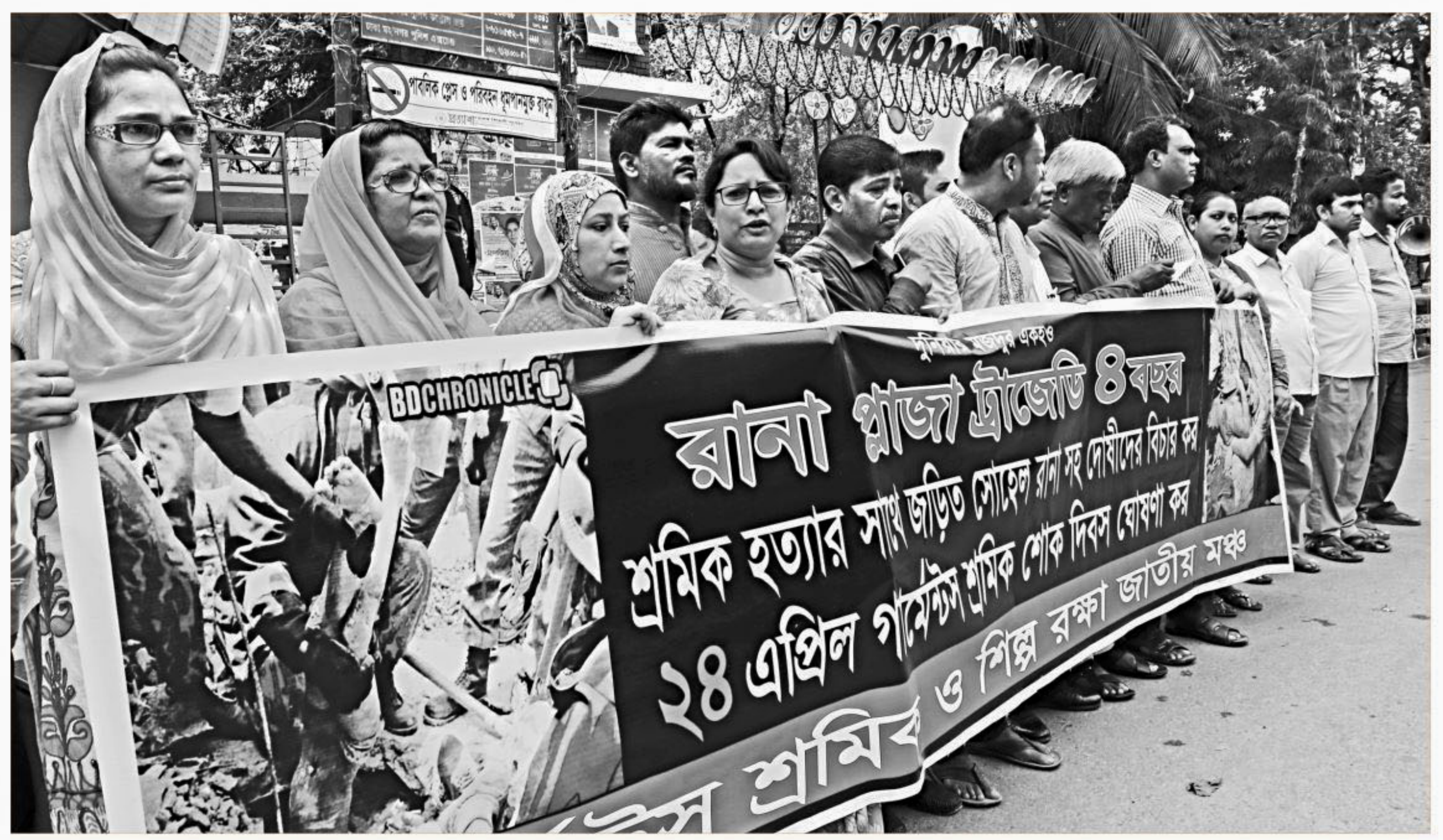
People under the banner of Garments Shramik o Shilpa Rakkha Jatiya Mancha demand trial of all who are responsible for Rana Plaza collapse and announcement of April 24 as "Mourning Day for Garment Workers", at a human chain in front of the capital's Jatiya Press Club yesterday, marking the fourth anniversary of the tragedy.

The two countries are also promoting political dialogue and trade and economic cooperation; and an intergovernmental commission on trade, economic, scientific and technical cooperation. Military cooperation is also developing. They said Russia considers Bangladesh as their reliable partner in South Asia.