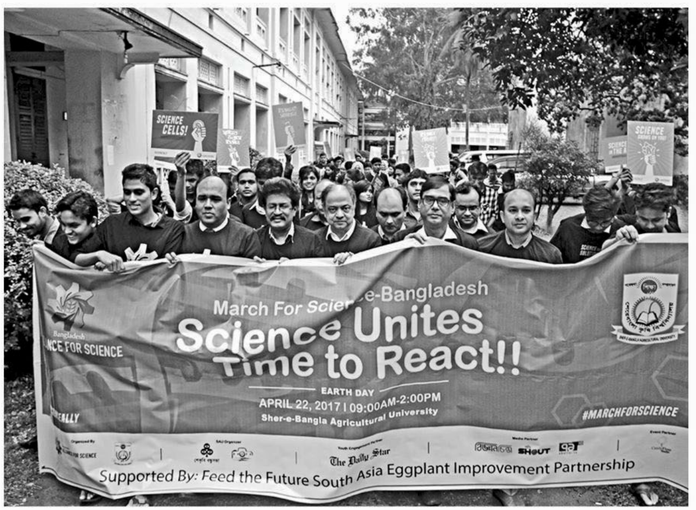
Alliance for Science Bangladesh, the Bangladesh chapter of US-based Cornell Alliance for Science, and Sher-e-Bangla Agricultural University bring out a procession on the university campus in Dhaka yesterday, marking World Earth Day.