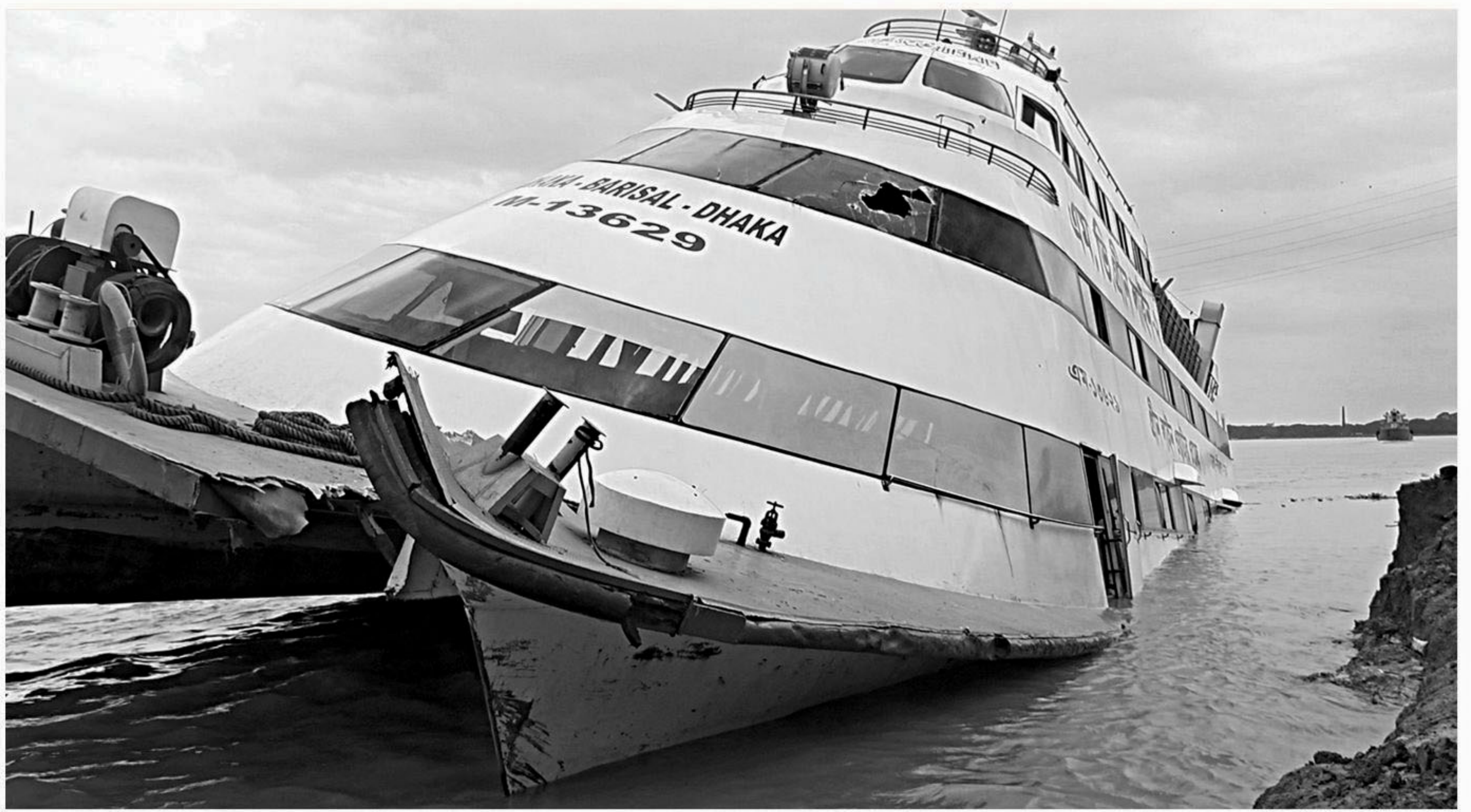
Passenger launch "MV Green Line" sinking in the Kirtonkhola river in Barisal after it collided head-on with a coal-laden cargo vessel yesterday. However, all the passengers and crew of both the vessels were rescued unhurt.