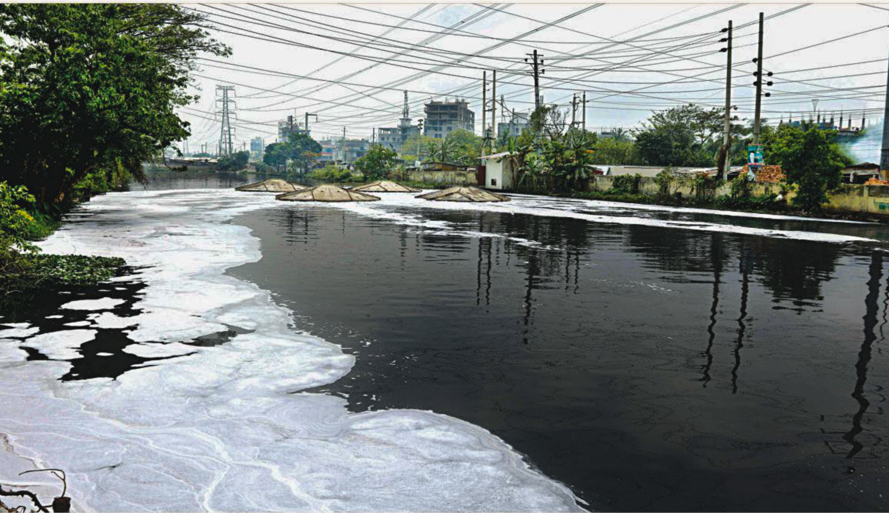
The Demra-Matuail canal in the capital is heavily polluted due to years of waste dumping. From this canal, Dhaka Wasa (Water Supply & Sewerage Authority) collects water and supplies it to people after treatment. Nearby, there is a notice stating that polluting the canal is a punishable act, but nobody seems to be paying heed to it.