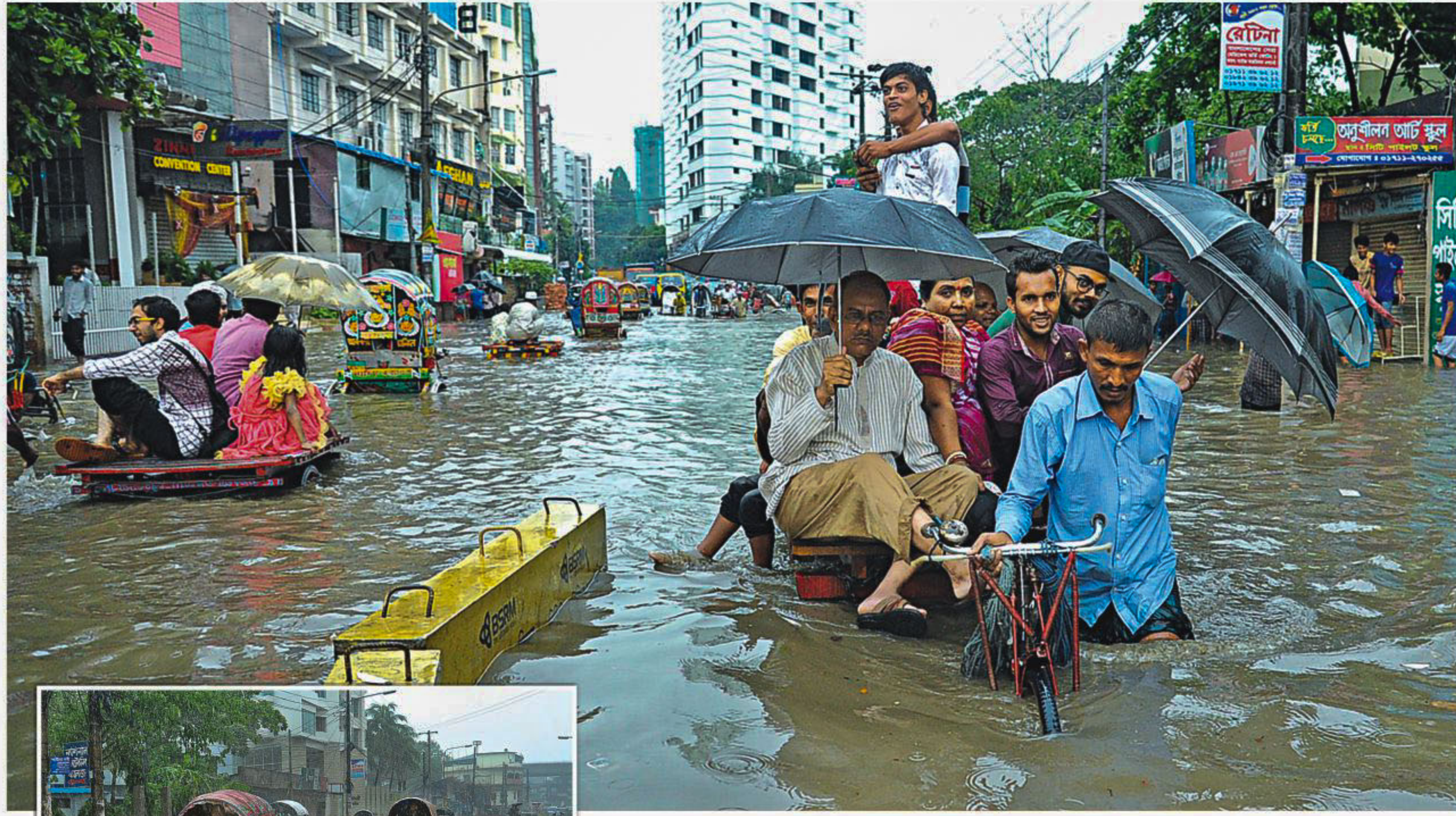
Rickshaws and vans push through waist-deep water at Sholoshahar in Chittagong yesterday morning. Hours of incessant rain led to waterlogging in many areas of the city, causing untold sufferings to people.