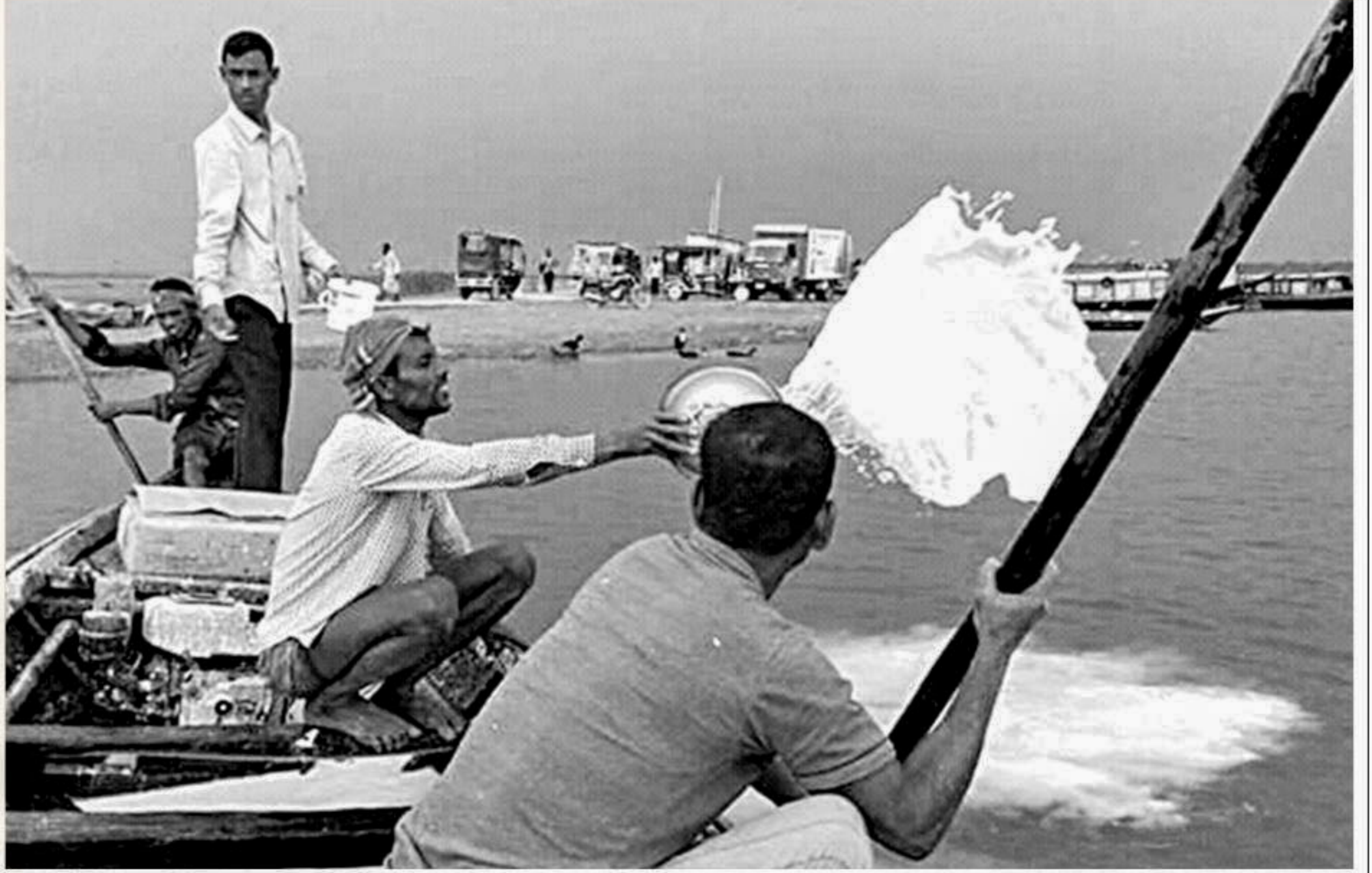
Staff of fisheries department spreading medicines in the contaminated haor water to save rest of fishes in Mohanganj upazila of Netrakona.