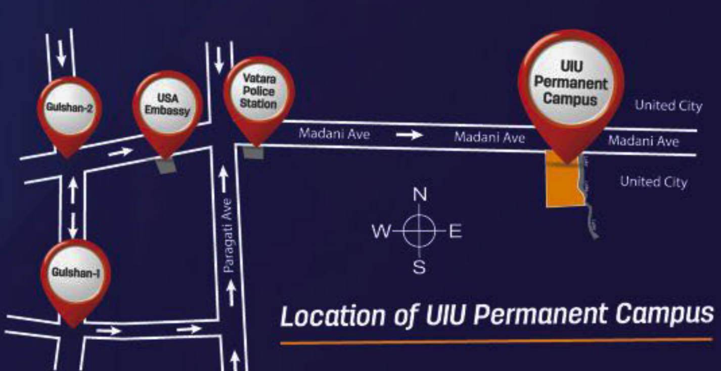
Location of UIU Permanent Campus