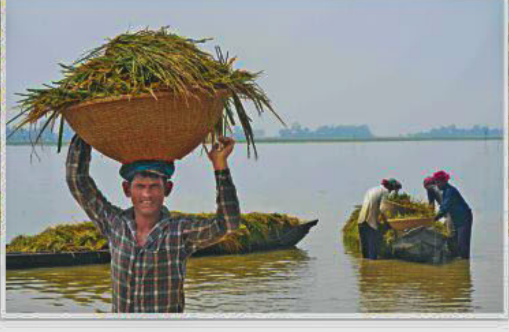
A farmer in despair sees his inundated boro field at Ikram village in Baniachong upazila of Habiganj. Inset, farmers bring whatever they could save from their flooded boro fields in the haor area.

"I cannot afford Pahela Baishakh celebration for my family this time as the flood destroyed ripe paddy before its harvest."