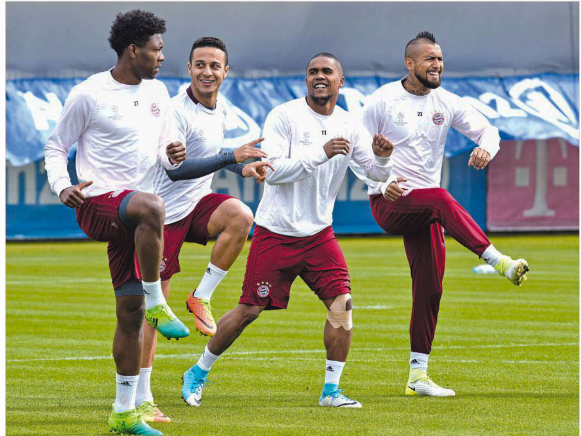
Bayern Munich players do warm-up exercises prior to a training session at the team's training ground in Munich yesterday on the eve of their Champions League quarterfinal against Real Madrid.

The Confederations Cup takes place in June-July this year, a year before Russia hosts the World Cup for the first time. "We are concerned about the ticket sales for the tournament," R-Sport agency quoted deputy prime minister Vitaly Mutko as saying. "There are 200,000 tickets sold so far, while we wanted 700,000. We will open ticket offices around the country on April 19."