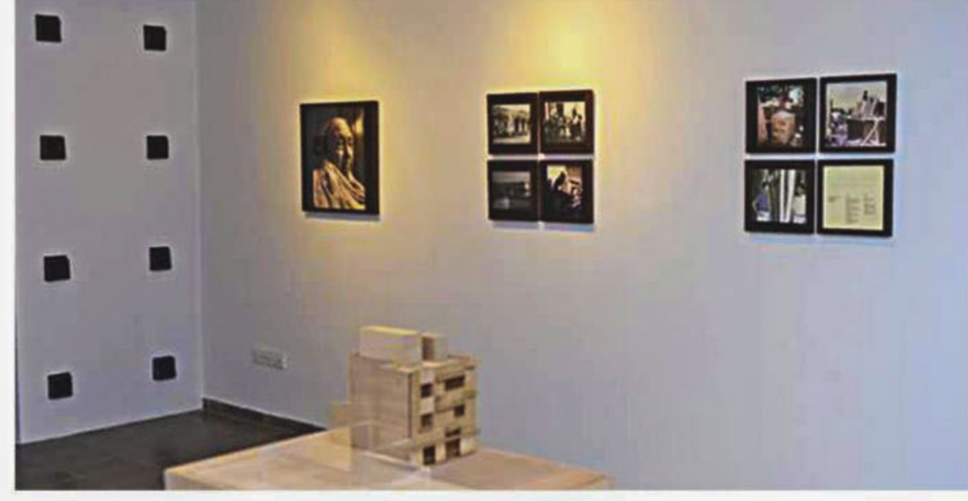
A view of the exhibition.