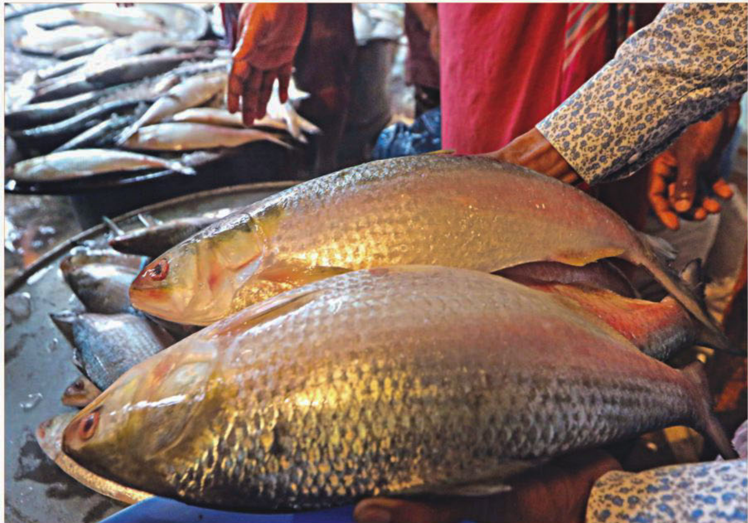
PRICEY CRAZE ... With Pahela Baishakh approaching, the hilsa craze begins. It is true in urban settings where a Panta-Ilish (rice soaked in water overnight and fried hilsa) is considered a delicacy and has somehow got linked to the Baishakh festivities. A section of fishmongers take advantage of the seasonal high demand and hilsa gets too pricey. Prime Minister Sheikh Hasina yesterday urged people to leave hilsa off the Pahela Baishakh menu and go for alternatives. The photo of large hilsa being sold at high prices was taken at Karwan Bazar.