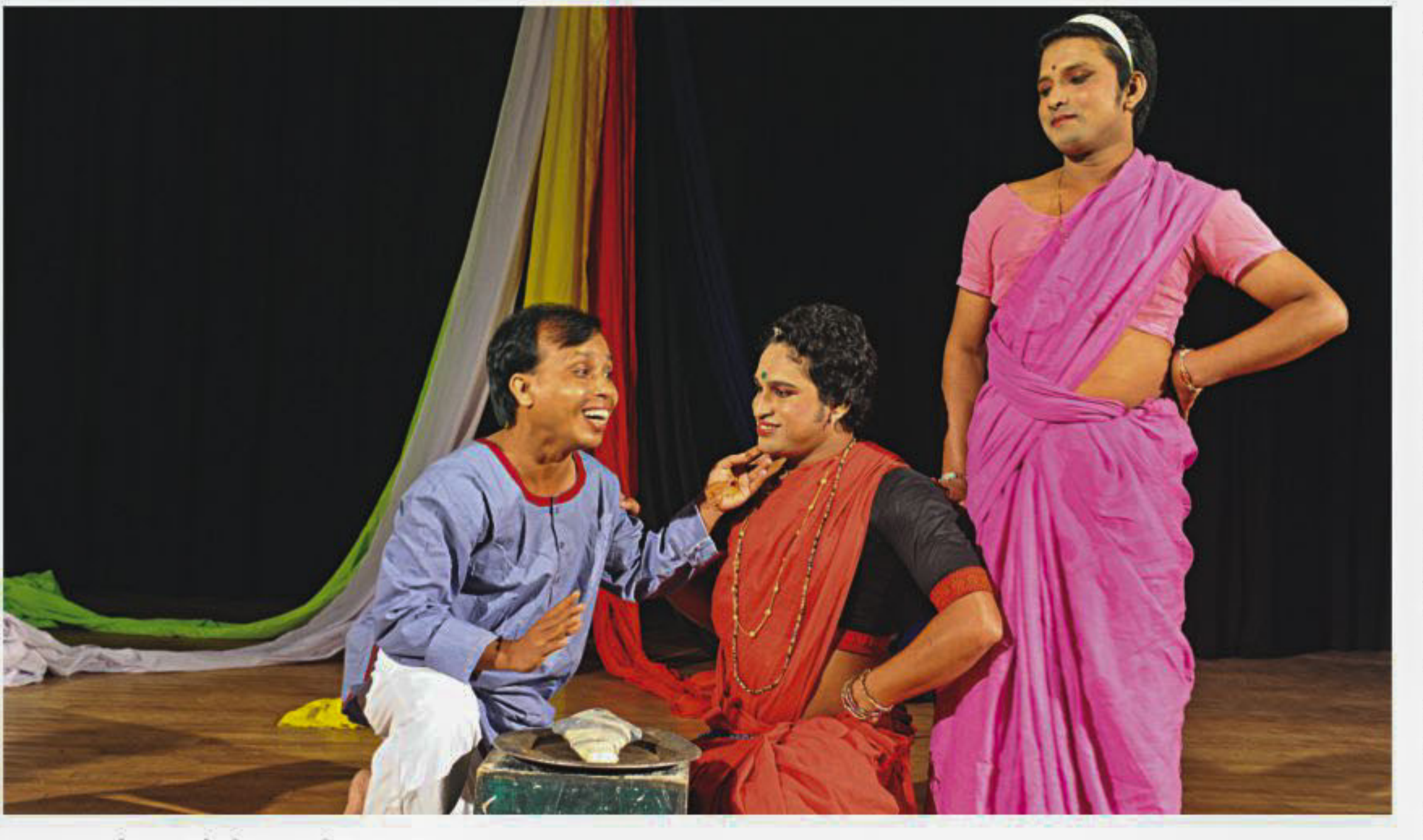
A scene from "Shikhandi Kotha"