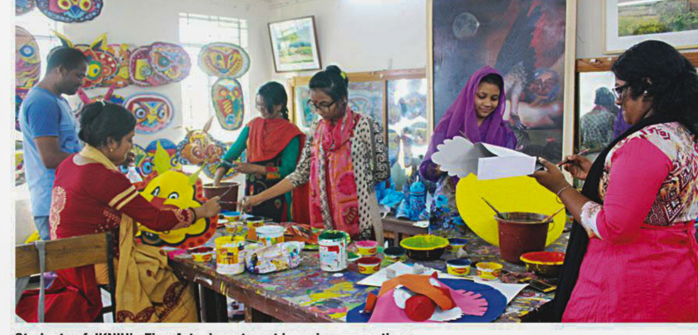
Students of JKKNIU's Fine Arts department busy in preparations.