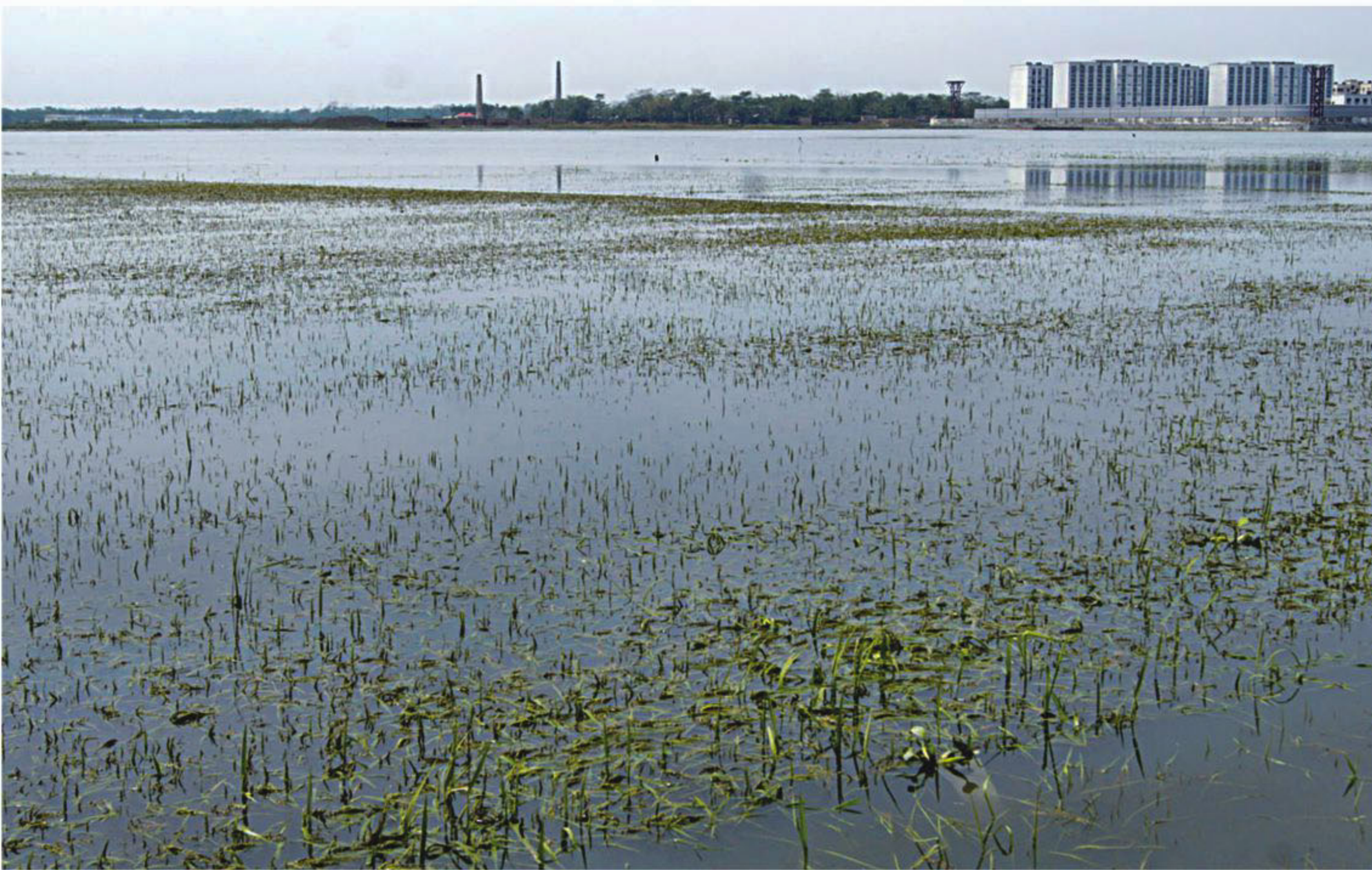
Paddy fields have been destroyed in vast low-lying areas alongside Chamaurakandi haor (a type of wetland) under Sadar upazila of Sylhet. Flash floods due to unseasonal rain along with hail destroyed almost all embankments in Sylhet and three other neighbouring districts, inundating around 80 thousand hectares of crop lands. In Sylhet alone, about three lakh farmers have lost all their investments.

The case was filed by Anti-Corruption Commission with Pabna Police Station on June 18, 2012.