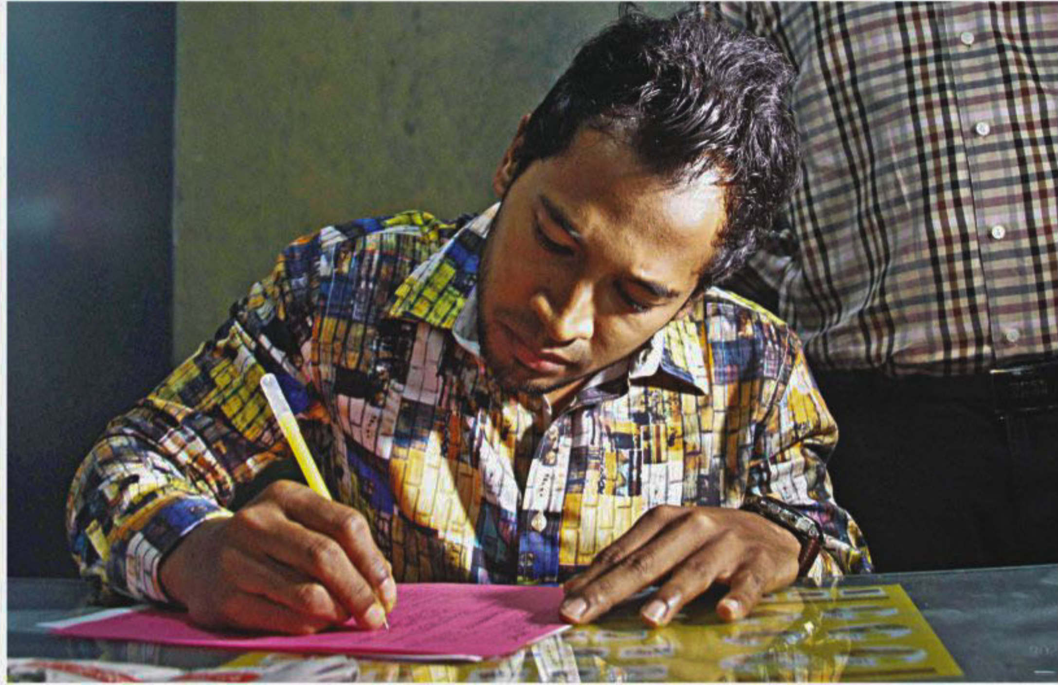
Bangladesh Test skipper Mushfiqur Rahim puts pen to paper for the Legends of Rugganj yesterday ahead of the Dhaka Premier League.

Mushfiqur will be playing alongside Mashrafe Bin Mortaza -- who had signed with Rugganj before leaving for Sri Lanka -- in the country's most coveted 50-over competition, which is scheduled to start