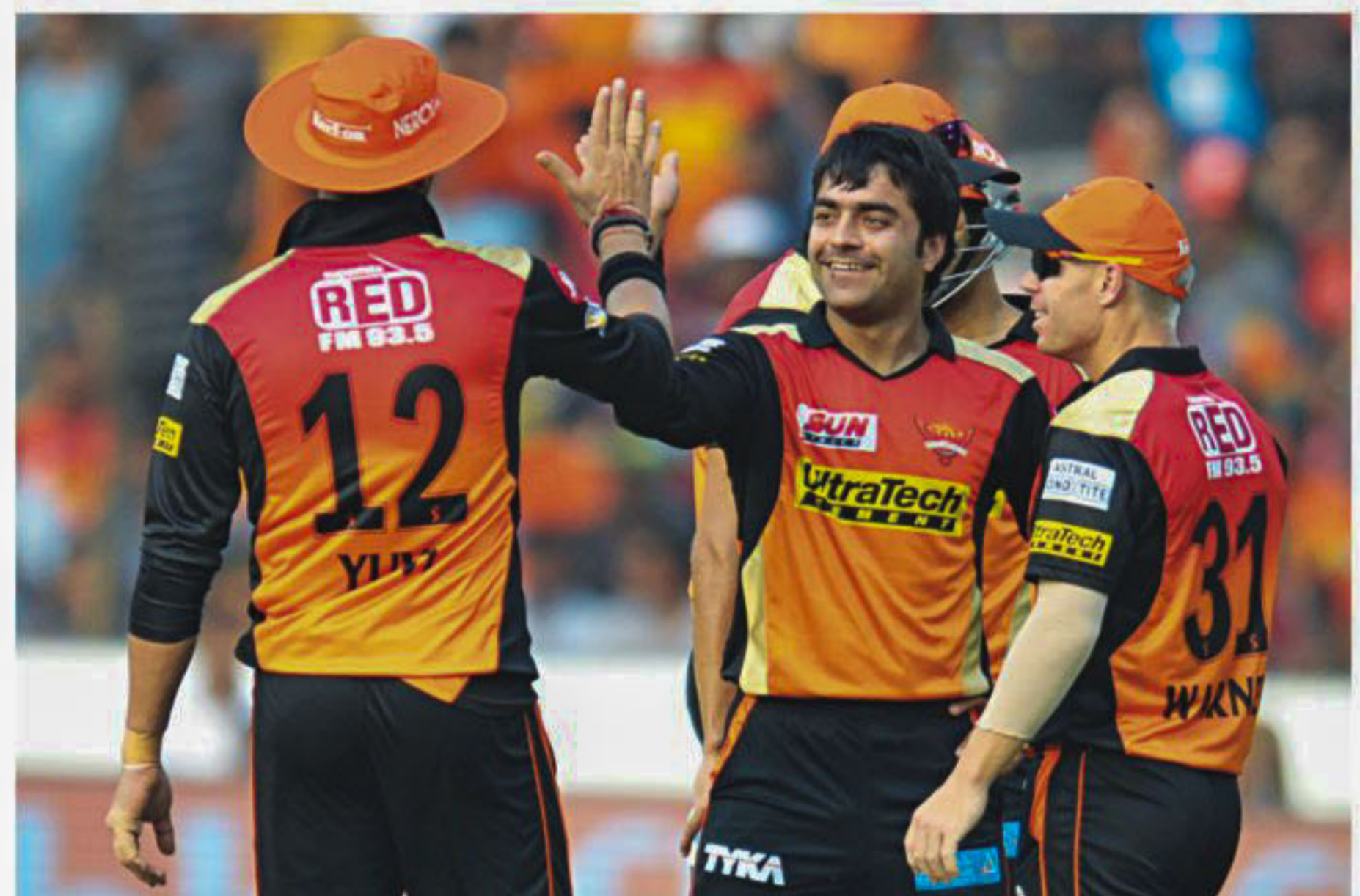
Sunrisers Hyderabad's Afghan leg-spinner Rashid Khan (C) celebrates with teammates after taking one of his three wickets against Gujarat Lions in the Indian Premier League in Hyderabad on Sunday.

But Italy had demonstrated the fighting spirit which saw them knock out defending champions Argentina in the first round to stay alive in their quarter-final on Saturday with a thrilling doubles win.