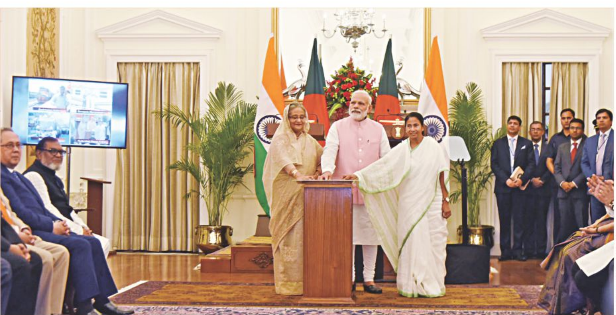
Prime Minister Sheikh Hasina, Indian Prime Minister Narendra Modi and West Bengal Chief Minister Mamata Banerjee inaugurate a Bangladesh-India rail service through videoconferencing at the Hyderabad House in New Delhi yesterday.