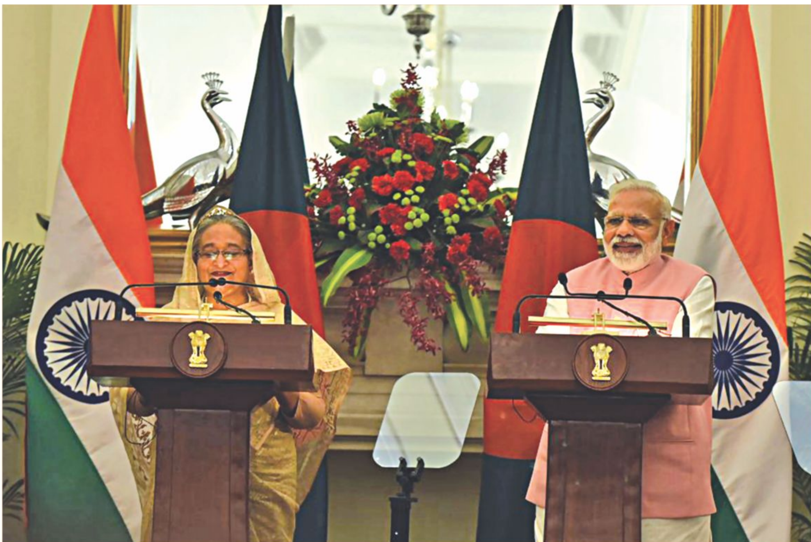
Prime Minister Sheikh Hasina and Indian Prime Minister Narendra Modi address a joint media briefing at Hyderabad House in New Delhi yesterday. Hasina is currently on a four-day state visit to India.

SEE ONLINE FOR FULL TEXT OF THE JOINT STATEMENT