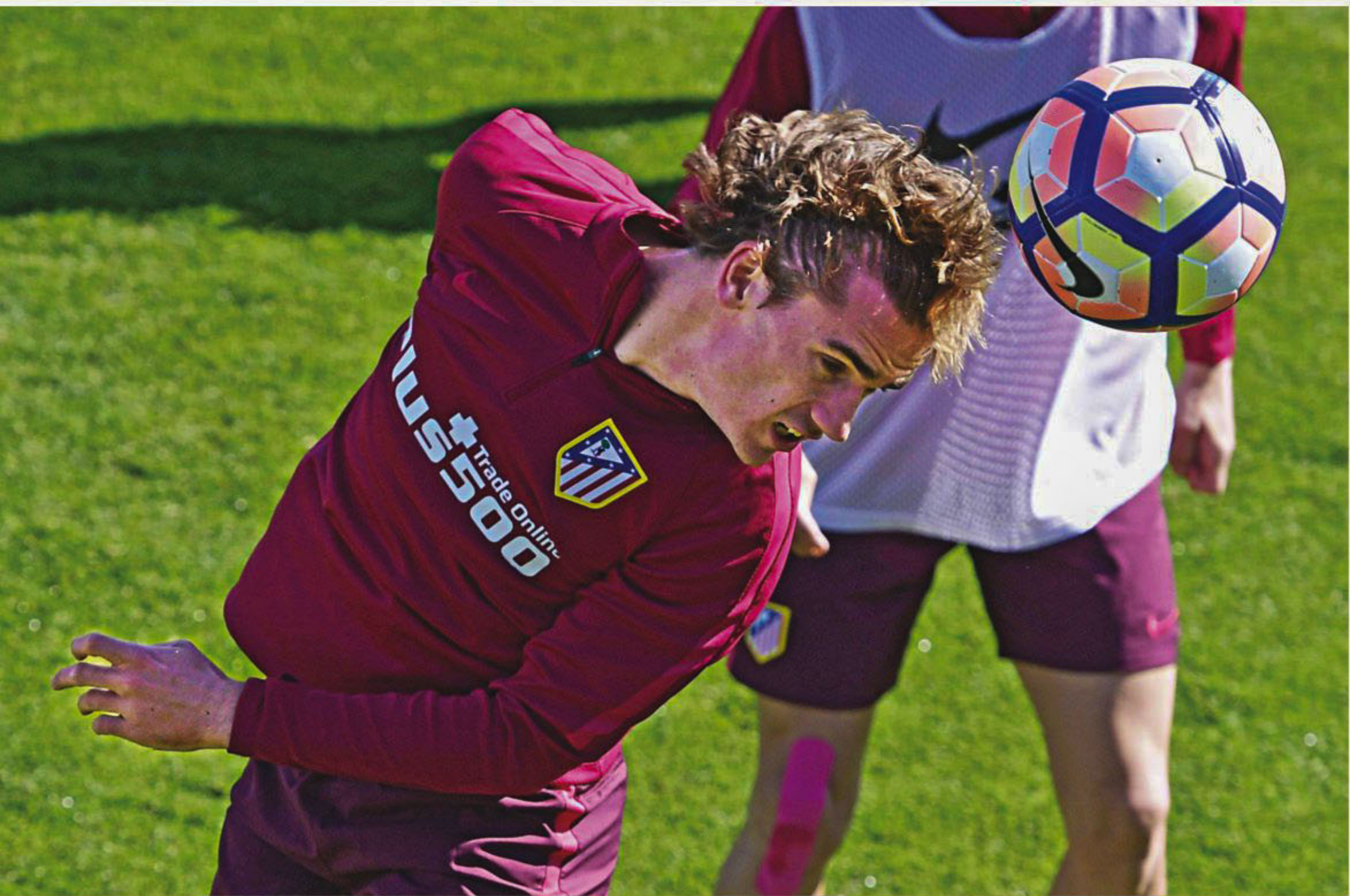
Atletico Madrid star Antoine Griezmann heads the ball during a training session in Majadahonda yesterday on the eve of their La Liga match against Real Madrid.