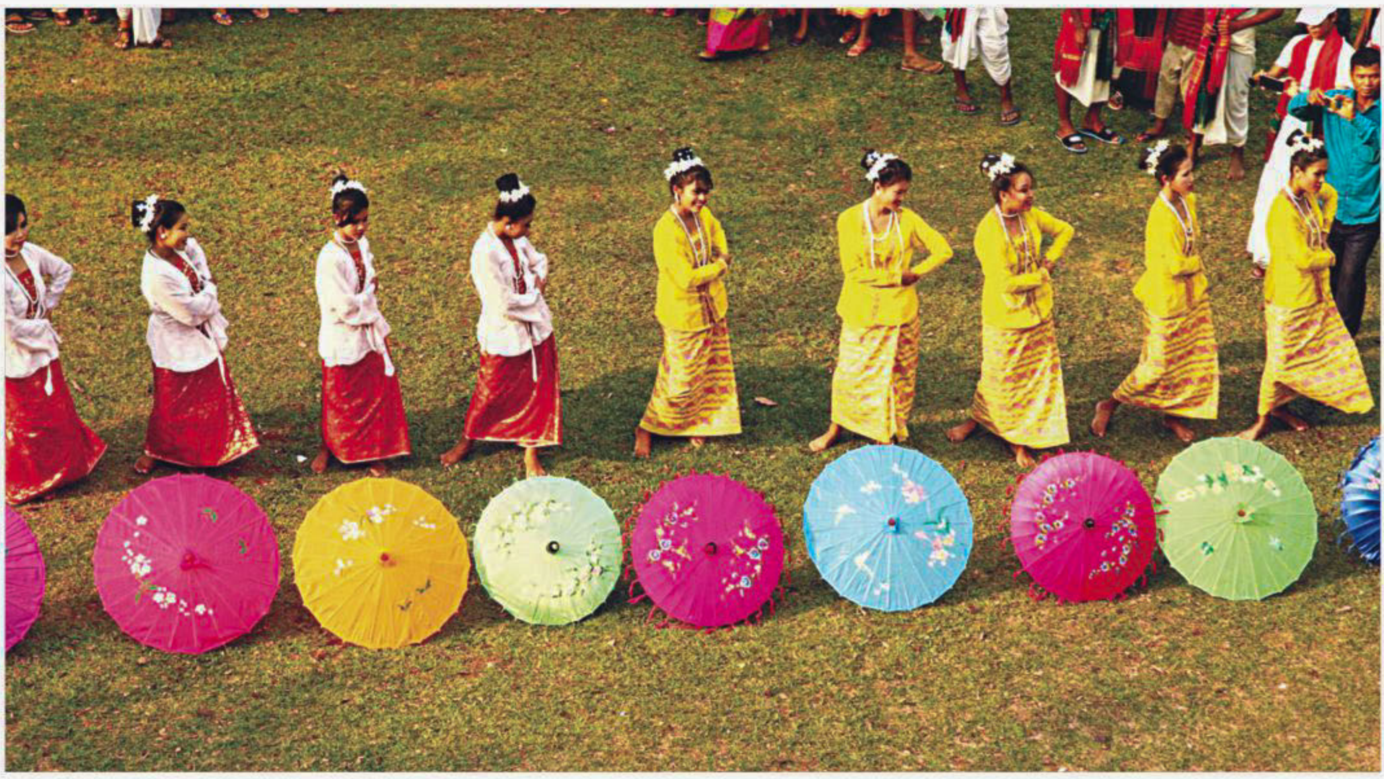
Marma girls perform traditional umbrella dance to mark the beginning of Biju.