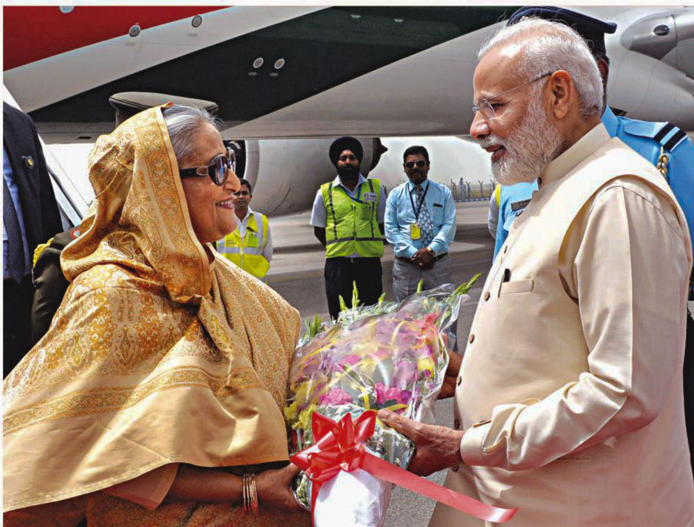
Prime Minister Sheikh Hasina was welcomed by Indian Prime Minister Narendra Modi at Air Force Station, Palam in New Delhi yesterday. Hasina reached the Indian capital on a four-day official visit.

PM Sheikh Hasina and I are determined to take the relationship between our nations to a new level.