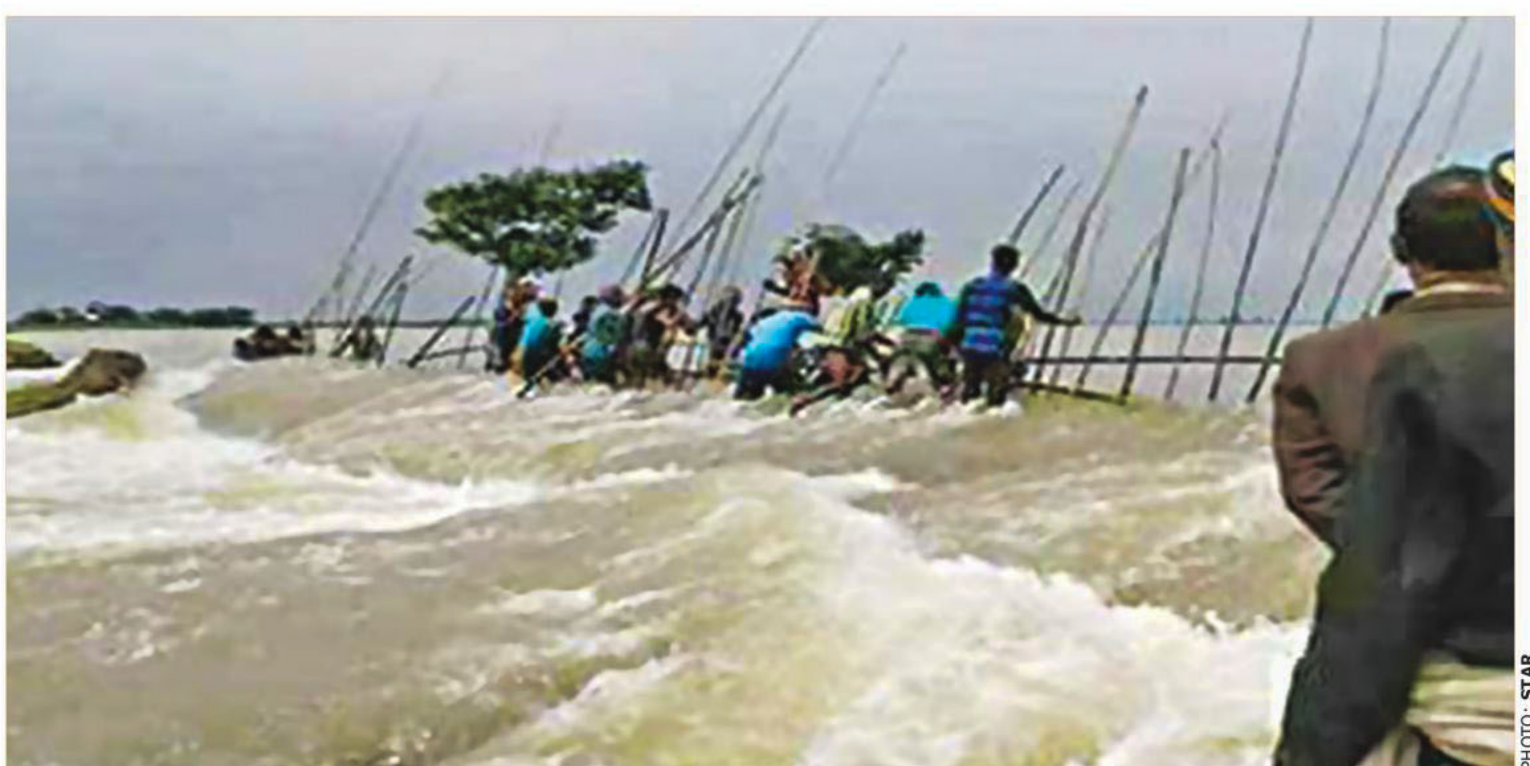
Villagers try to save a breached embankment hit by flashflood in Khaliyajury upazila of Netrakona yesterday.

Suchitra Sen was born on April 6 in 1931 at Bhangbari village of Belkuchi upazila in Sirajganj. She passed her early life at Gopalpur Hemsagar Lane in Pabna town. She died on January 17 in 2014 in Kolkata due to old age complications.