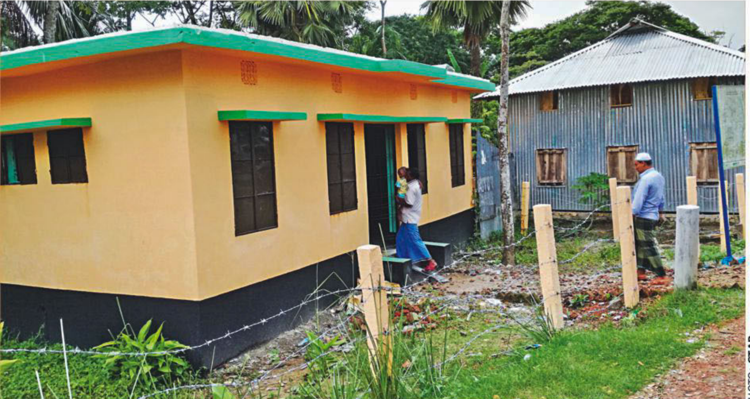
The community clinic was renovated after a demand at an interface meeting at Dalbuganj of Kalapara upazila.