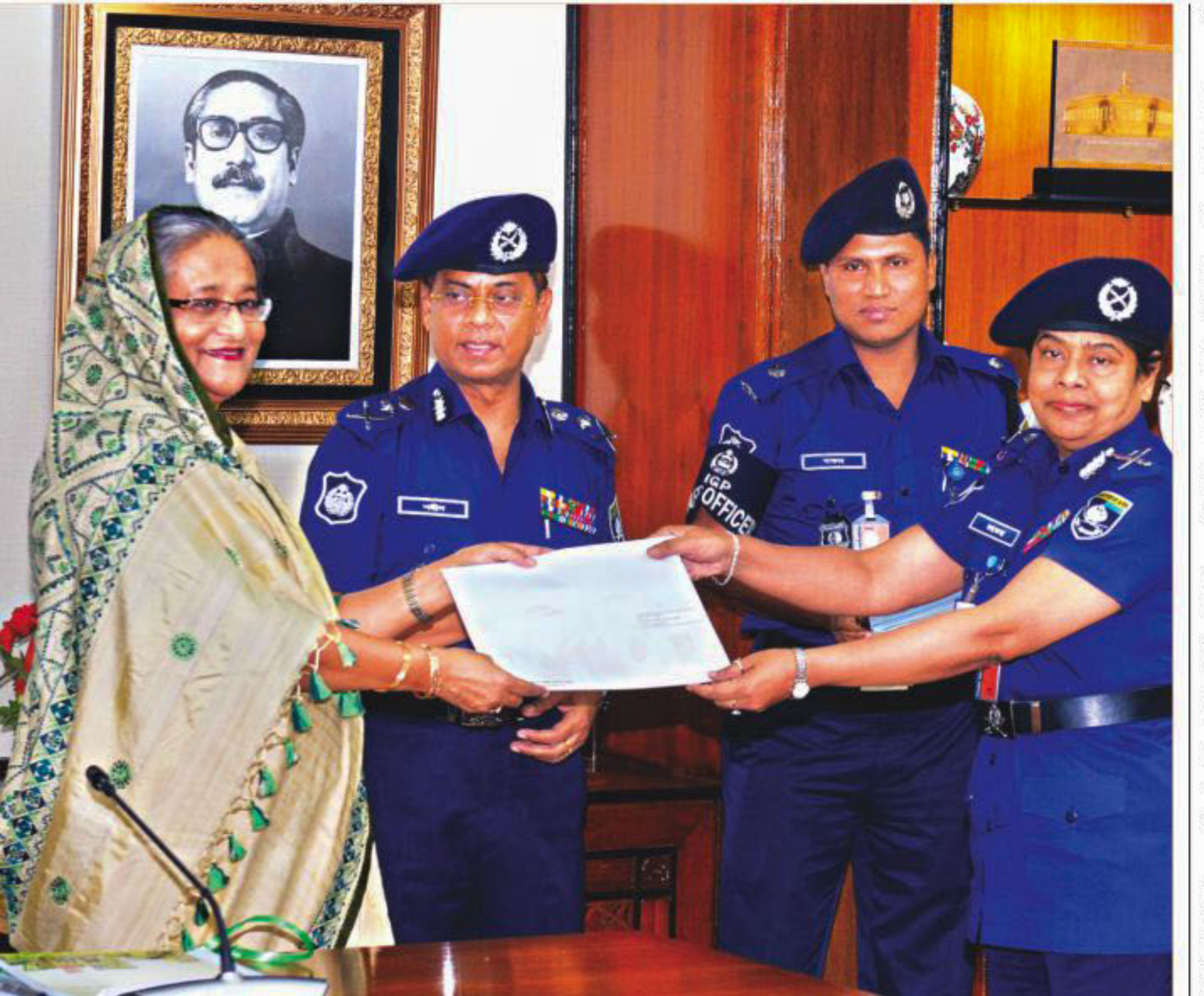
Prime Minister Sheikh Hasina hands over the documents of a land plot to a police officer at the Prime Minister's Office in the capital yesterday. The plot was under a housing scheme for police officers, which was implemented by Bangladesh Police Officers' Multipurpose Cooperative Society. A total of 20 officers received plot documents yesterday.