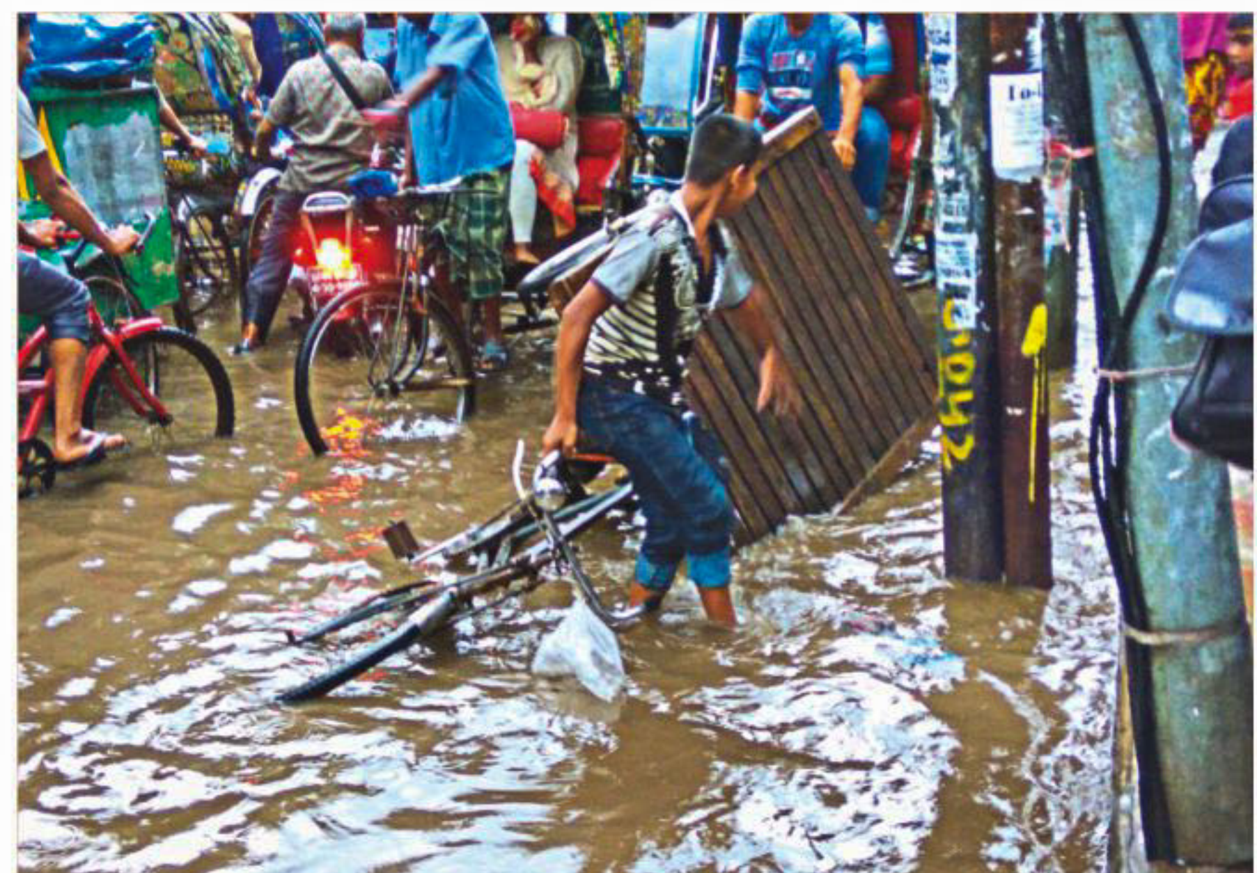
A pedestrian helps another cross a puddle and onto the footpath at Farmgate while several others wait to follow suit after it rained yesterday afternoon submerging most streets of the capital and causing waterlogging at places. At Moghbazar a rickshaw-van puller tries to get the vehicle back on its wheel after it tripped over a hole hidden under water. Holding a polythene sheet overhead, a woman tries to protect herself and a dismantled wooden bed from rainwater as she transports on a rickshaw at Shahbagh.