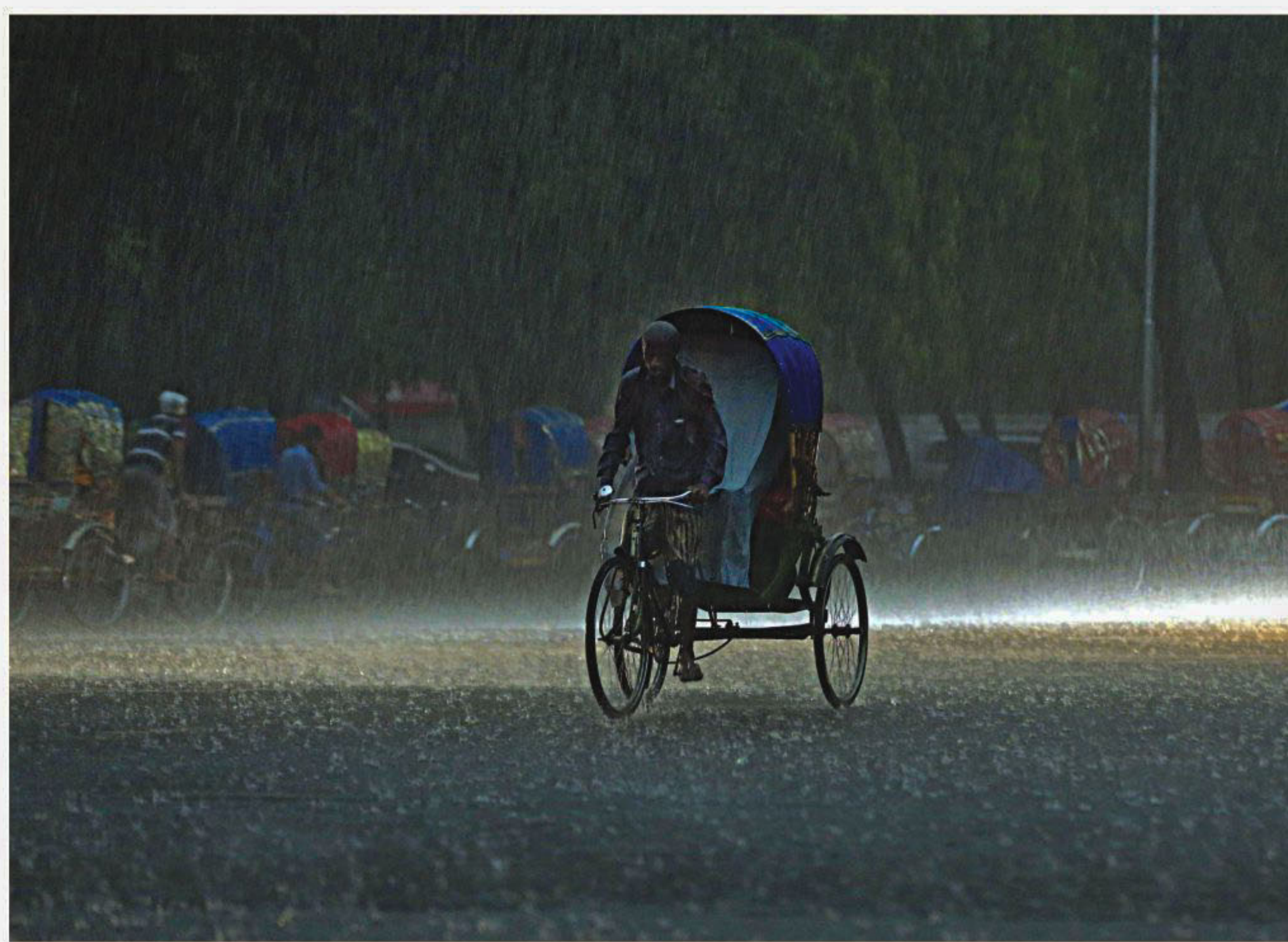
Amidst heavy downpour and gusts yesterday afternoon, a rickshaw puller tries to move ahead with his passenger tucked behind a curtain on the Dhaka University campus. The hour-long downpour dumped 33mm rain according to the met office. Major roads and local lanes went under water in many areas. More photos on page 3.