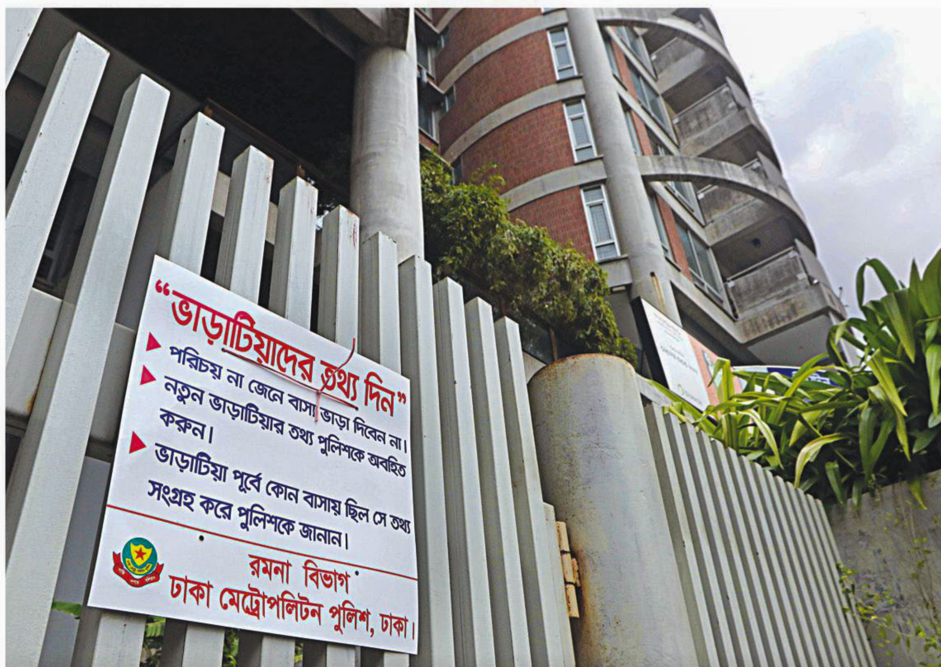
A notice asking landlords to collect tenant information for the police hangs at the entrance of a building on Eskaton Road in the capital. Dhaka Metropolitan Police has distributed forms to house owners to get necessary details about their tenants, a move law enforces said was made to ensure security of citizens. The photo was taken yesterday.