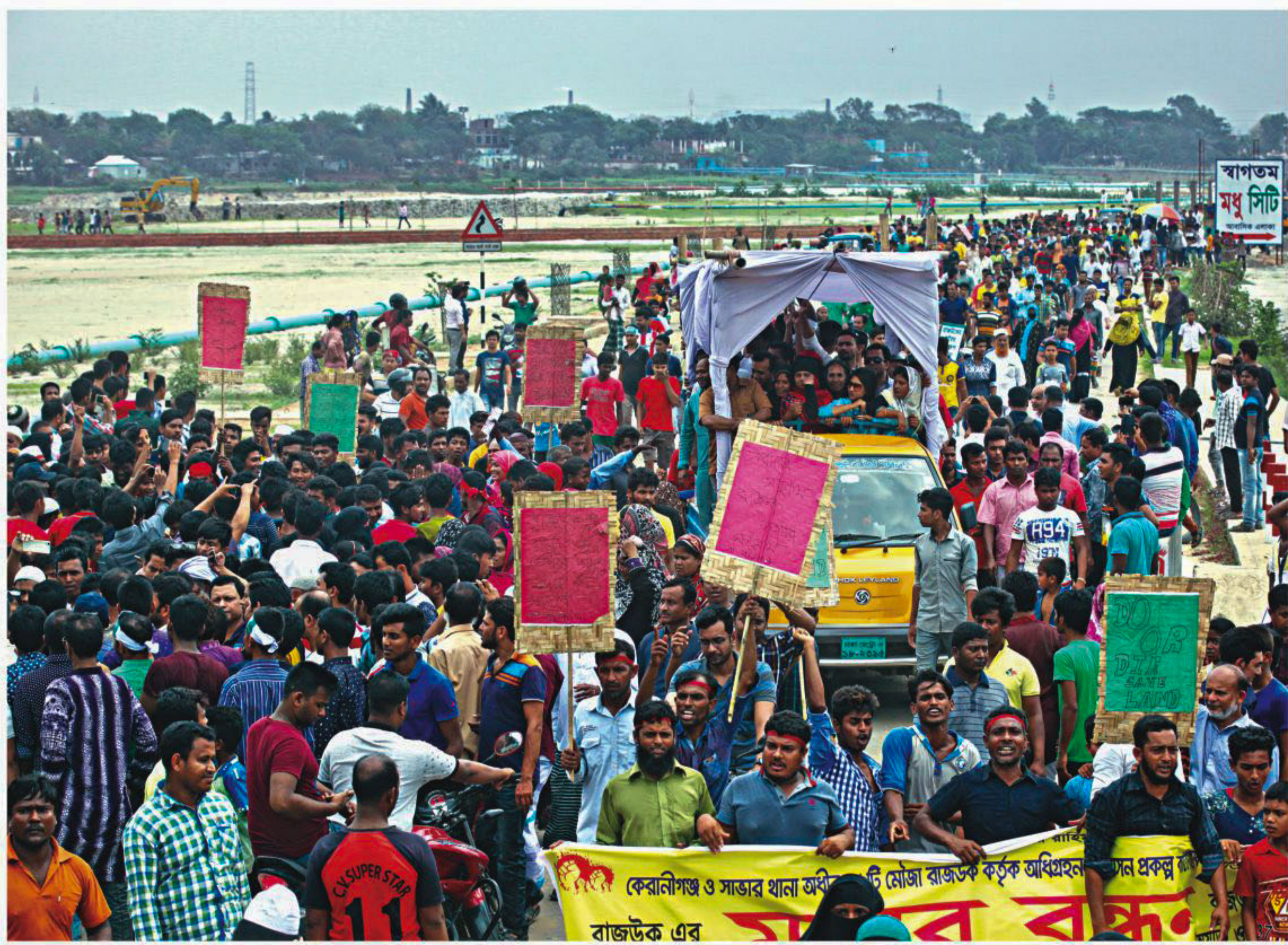
Hundreds of people from Keraniganj and Savar demonstrate in Atibazar area of Keraniganj yesterday protesting a proposed land acquisition by Rajuk for a housing project in the area.