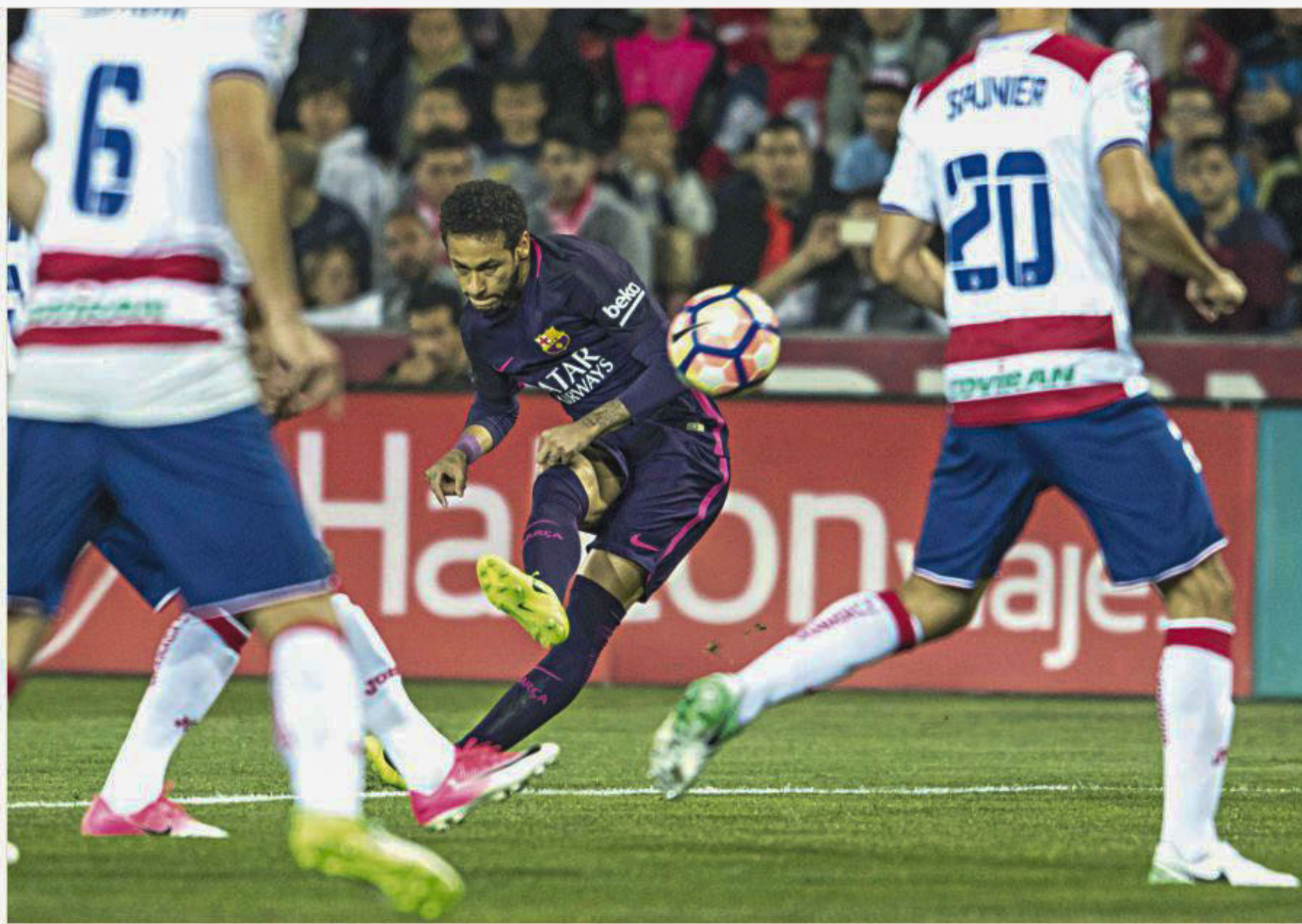
Barcelona forward Neymar (C) takes a shot during their La Liga match against Granada at the Nuevo Los Carmenes Stadium on Sunday. Neymar scored the fourth goal to reach a milestone of 100 goals for the club.

Indian Cricket Board's (BCCI) move to stall the proposed constitutional and financial reforms in the ICC may suffer a roadblock if BCCI tries to send N Srinivasan as its representative.