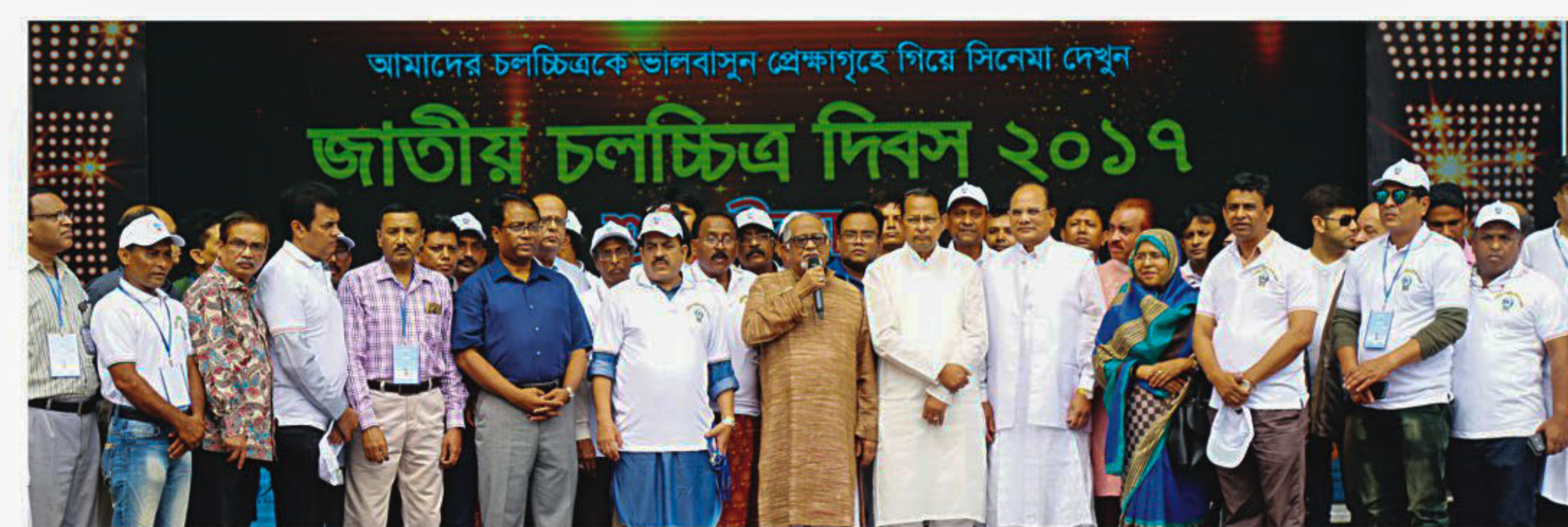
Members of the film fraternity at the inauguration ceremony.