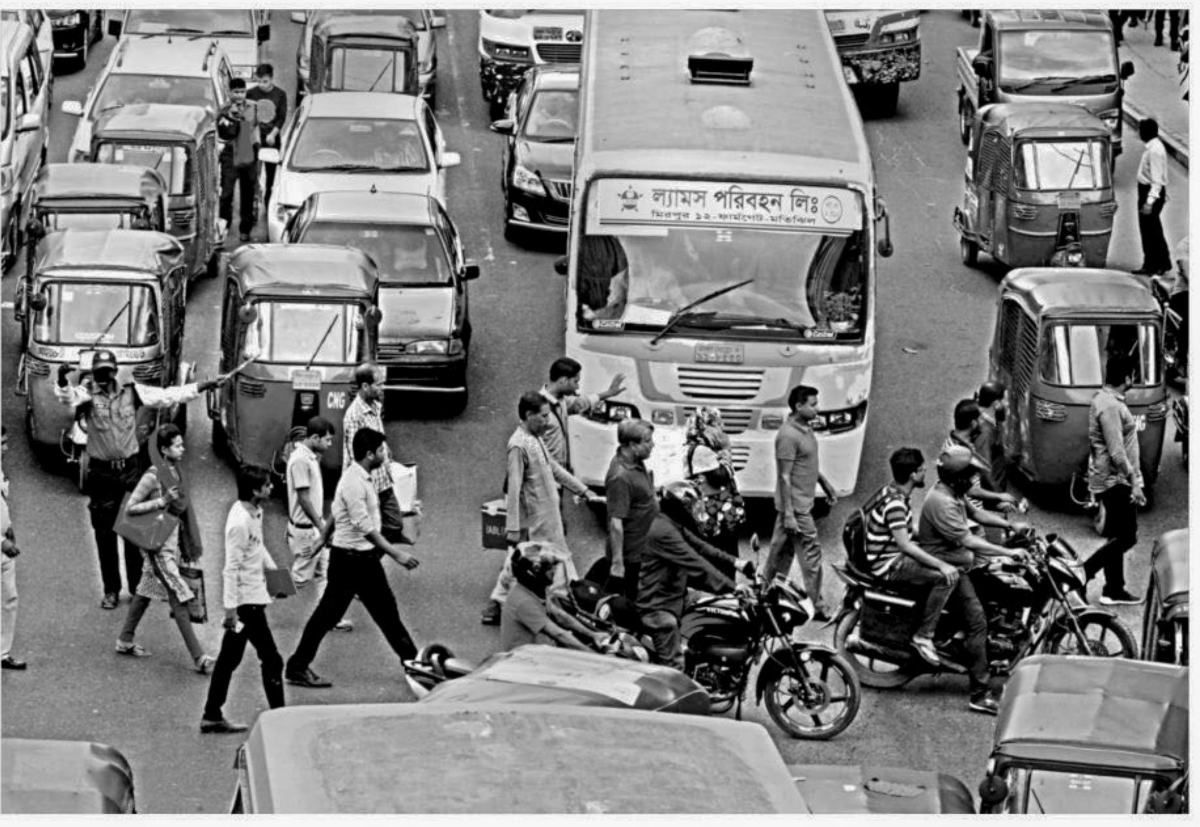
Avoiding a nearby footbridge, pedestrians cross busy Kazi Nazrul Islam Avenue in Dhaka on Sunday, putting themselves at risks of accident.