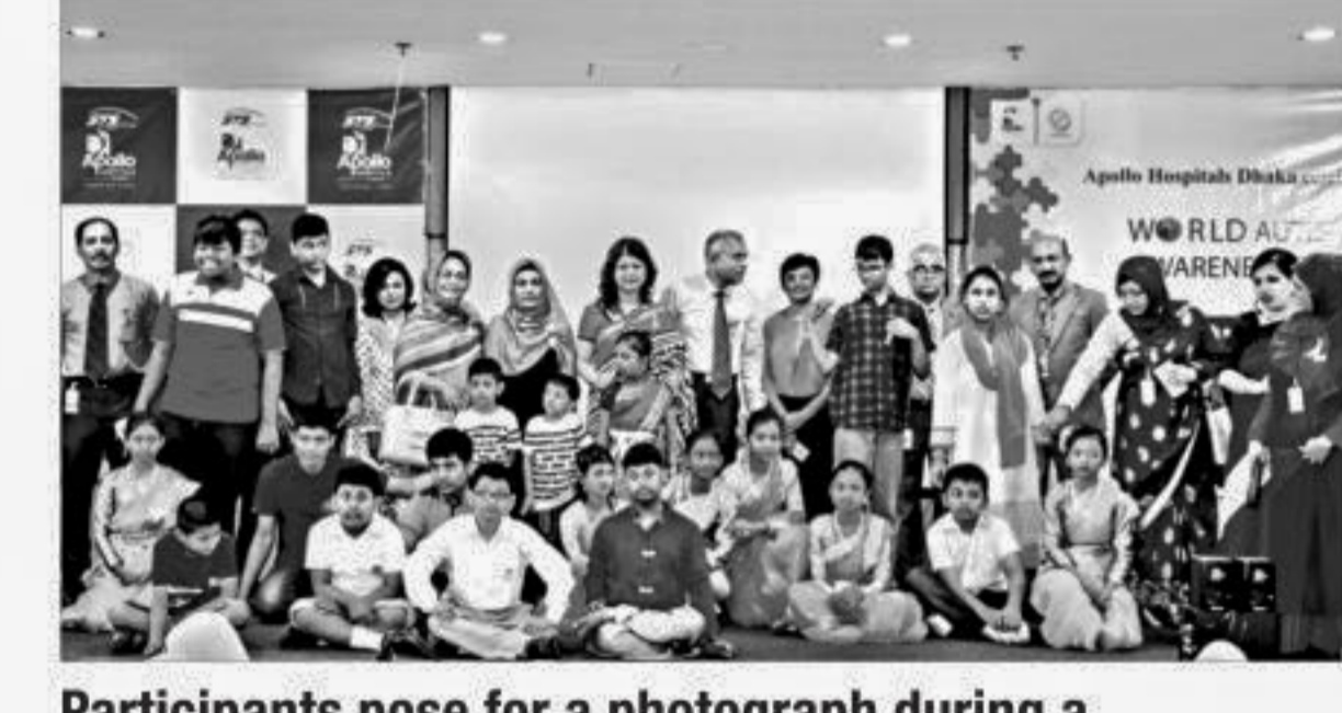
Participants pose for a photograph during a programme, organised by Apollo Hospitals Dhaka, marking World Autism Day. A three-day event, including a free health camp for autistic children, concluded yesterday.