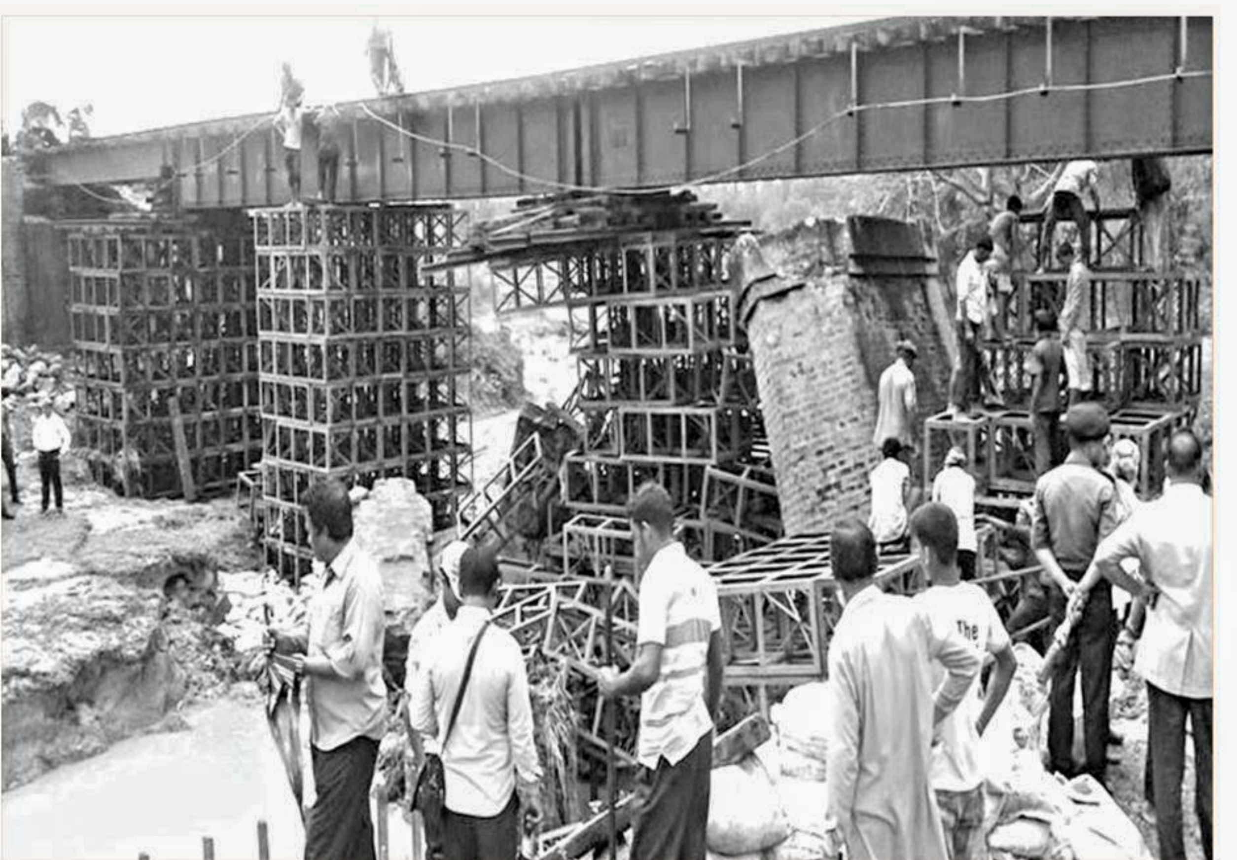
Workers yesterday repair a railway bridge which collapsed due to heavy rain in Madhabpur upazila of Habiganj on March 30.