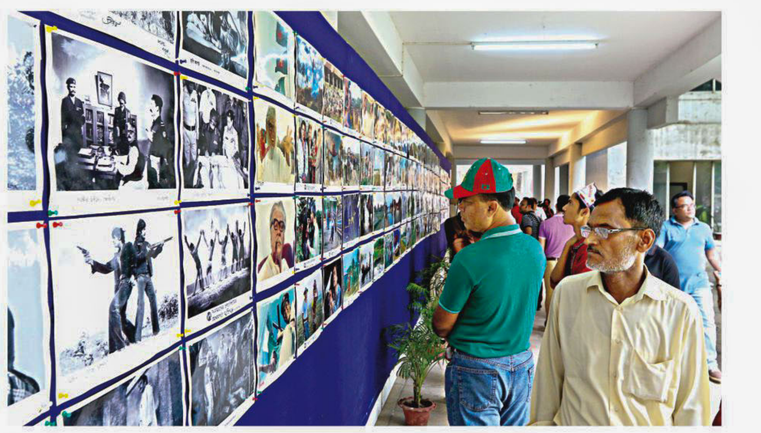
An exhibition of film stills is an attraction of the day's programmes.