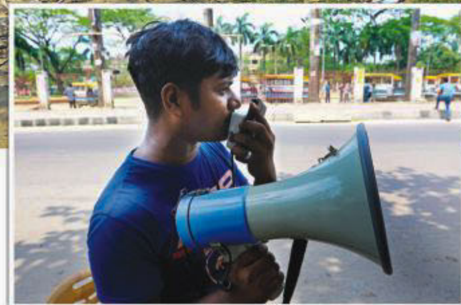
Vehicles belonging to a transport service being parked in the age-old park, intended for use by city residents, adjacent to Indira Road near a police box in Farmgate area in the capital yesterday. Dhaka North City Corporation recently evicted the transport service from Indira Road as the latter was illegally using a large portion of the road and the adjacent sidewalk as its passenger terminal. Inset, a transport worker using a megaphone to inform prospective passengers and passersby of their new "terminal".