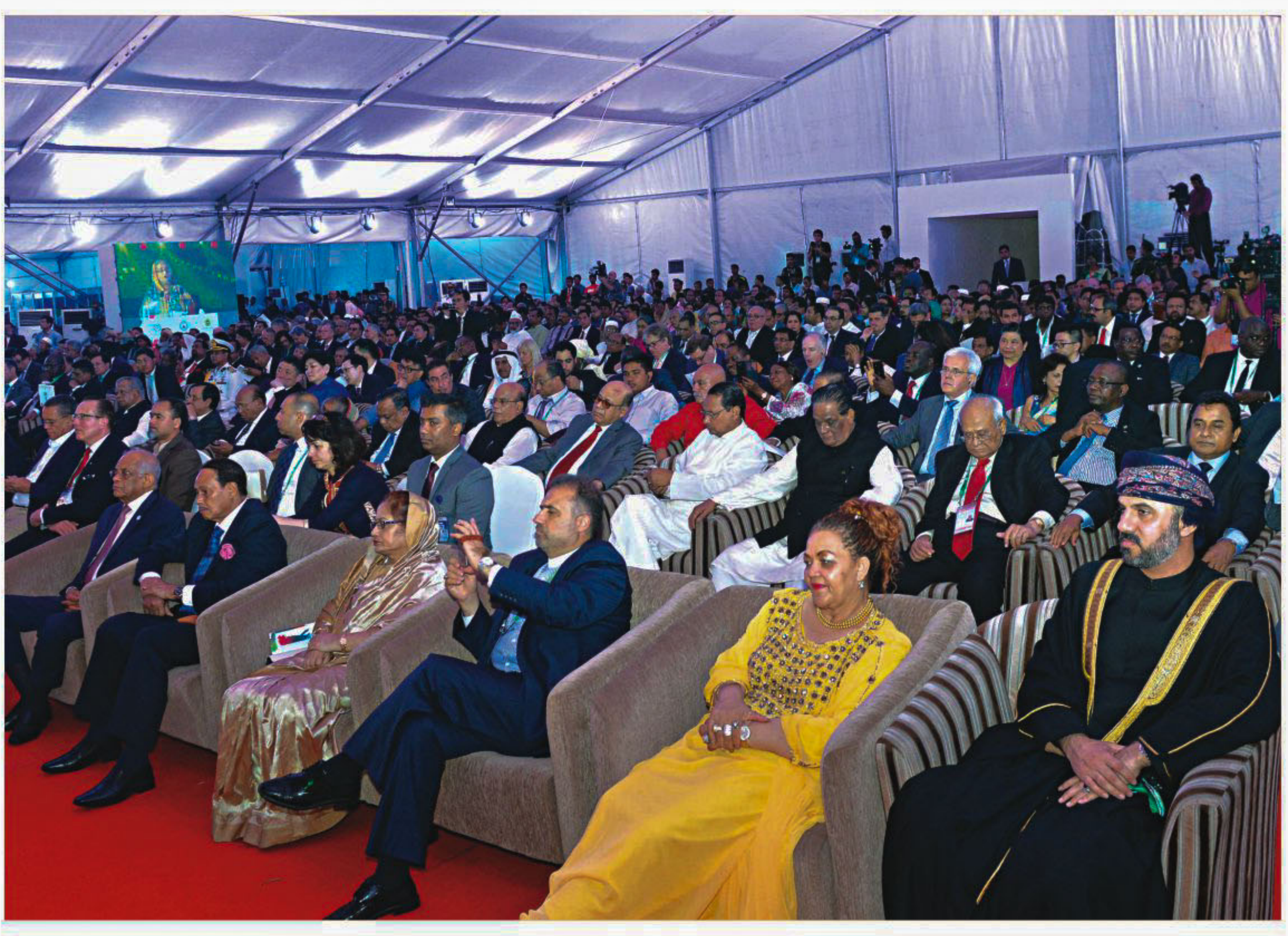
Members of parliaments of different countries at the inaugural ceremony of Inter-Parliamentary Union (IPU) at the South Plaza of Jaitiya Sangsad Bhaban yesterday.