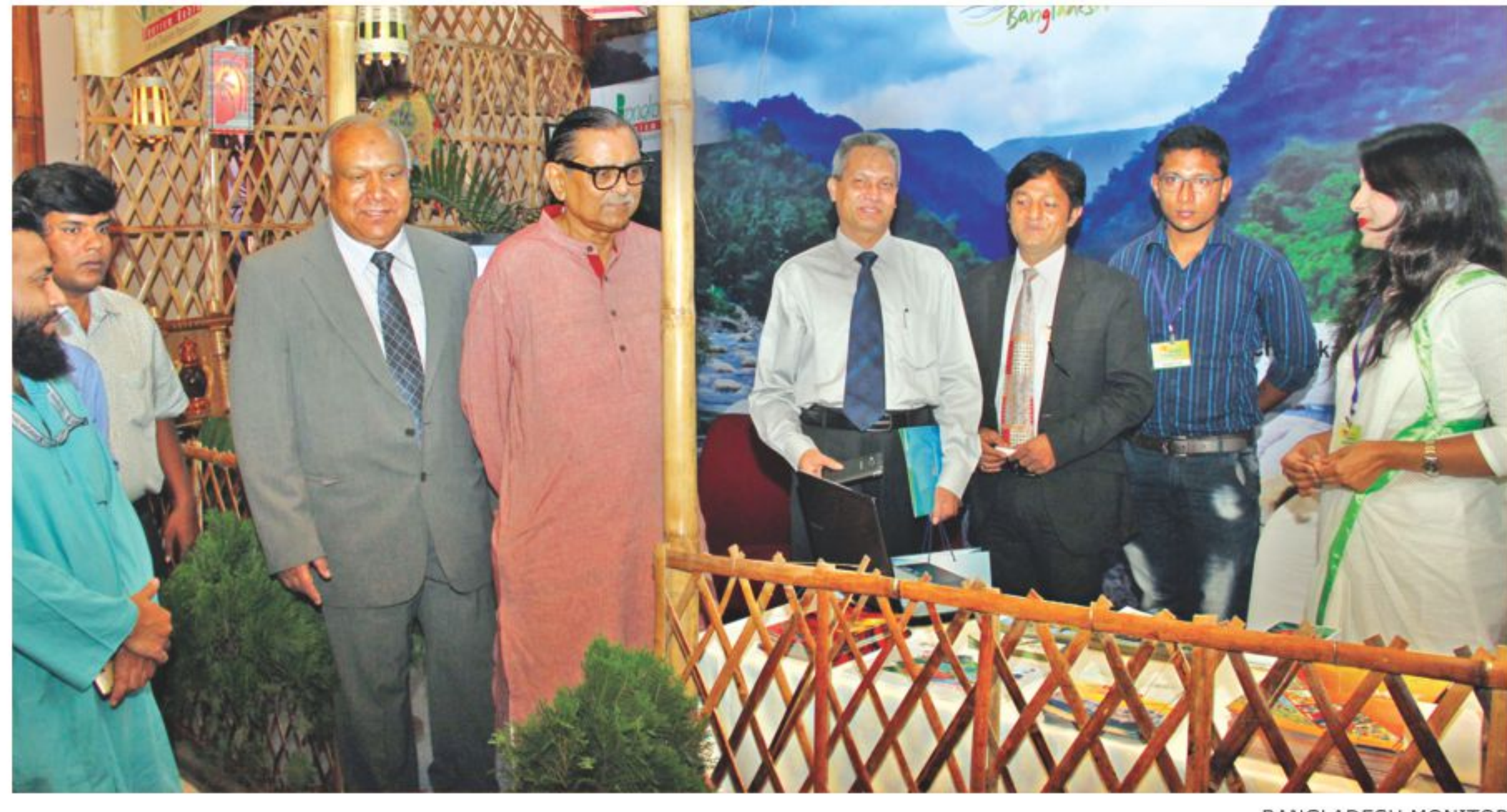
Rashed Khan Menon, civil aviation and tourism minister, visits a stall at Dhaka Travel Mart at Sonargaon hotel in Dhaka yesterday. Kazi Wahidul Alam, editor of the Bangladesh Monitor, the organiser, is also seen.