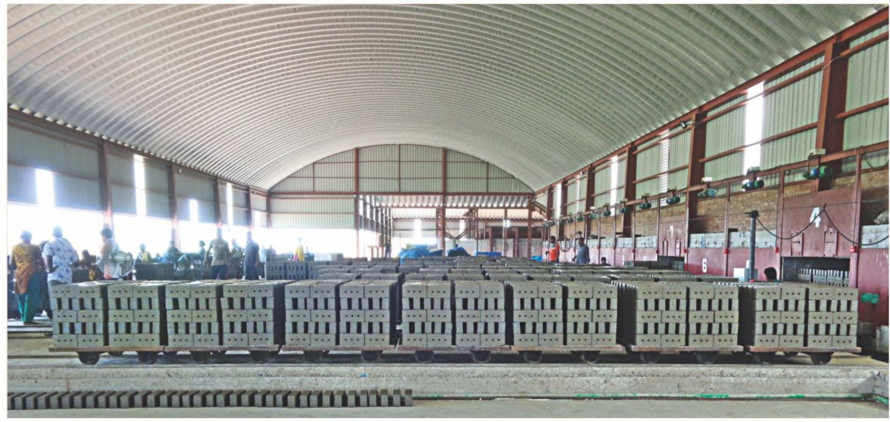
Environment-friendly brick kilns are emerging fast amid the rising demand from the builders of green structures.

The government also began to enforce the Brick Making and Kiln Establishment (Control) Act 2013 from July 2014 to control air pollution, deforestation, loss of land fertility and to protect public health.