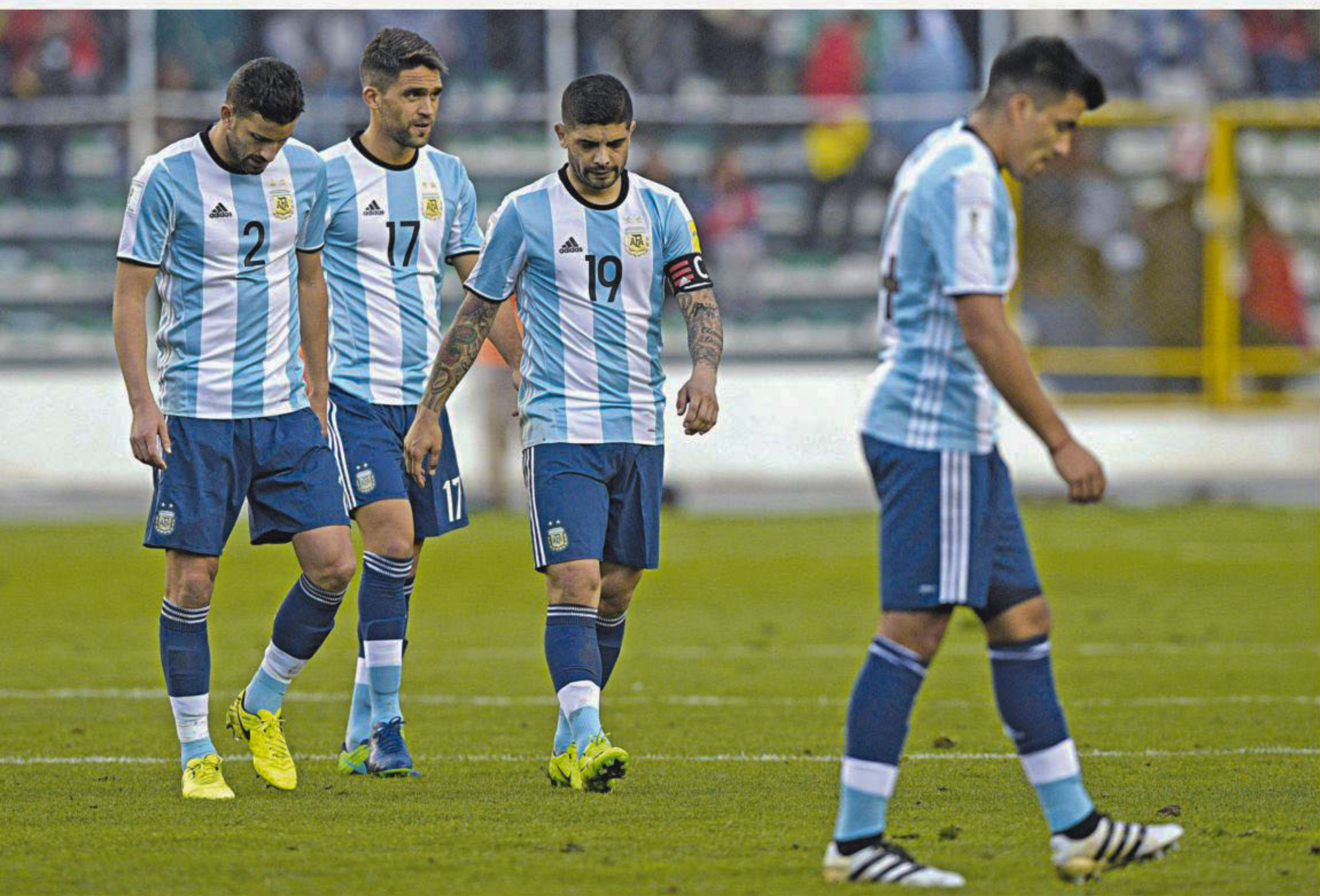
Dejected Argentina players leave the field after losing their 2018 World Cup qualifier against Bolivia in La Paz on Tuesday. The defeat leaves Argentina languishing just outside the automatic qualifying places.

Chowdhury Stadium, Chittagong Sri Lanka v Malaysia Venue: MA Aziz Stadium, Chittagong