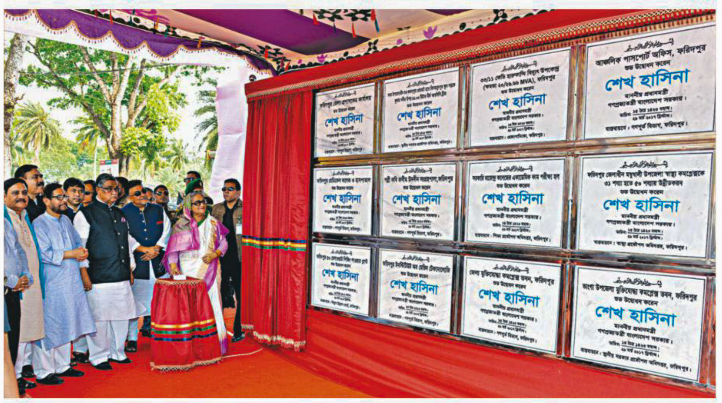
Prime Minister Sheikh Hasina unveils stone plaques of different development projects before speaking at a rally at Faridpur Government Rajendra College ground yesterday.

militancy and drug addiction. The path of terrorism and militancy isn't ours," she said. Mentioning that study was the first and only duty of students, the PM said, "They have to shun the path of militancy, drug addiction and terrorism." She also asked teachers and guardians to make sure that no student remained absent in any educational institution and took account of whom they befriend. Hasina said the government had taken various programmes to ensure higher education of students. "We're SEE PAGE 10 COL 1