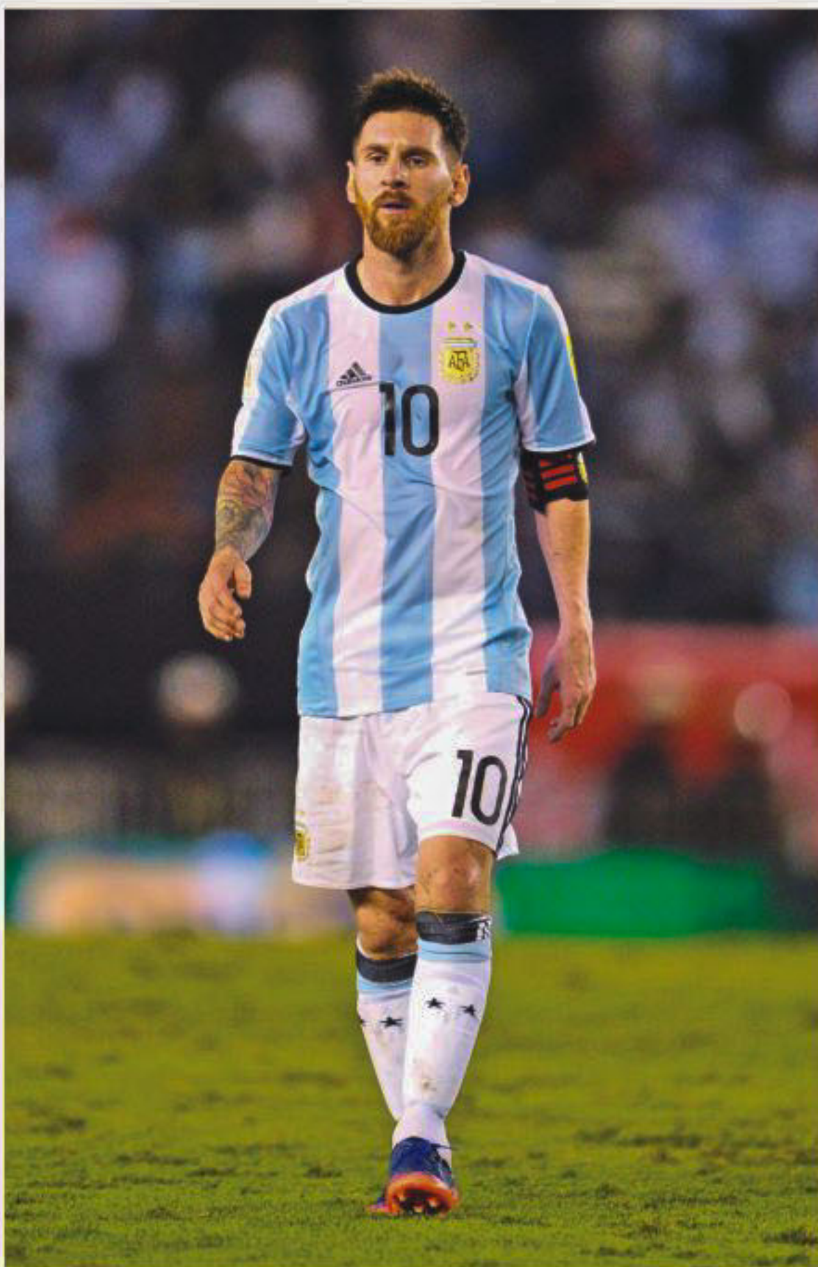
Argentina superstar Lionel Messi was handed a four-match ban by FIFA for swearing at an assistant referee during their 2018 World Cup qualifier against Chile last week.

Argentina's victory over Chile left them in third place overall in the 10-team South American qualifying competition for the World Cup with 22 points from 13 games.