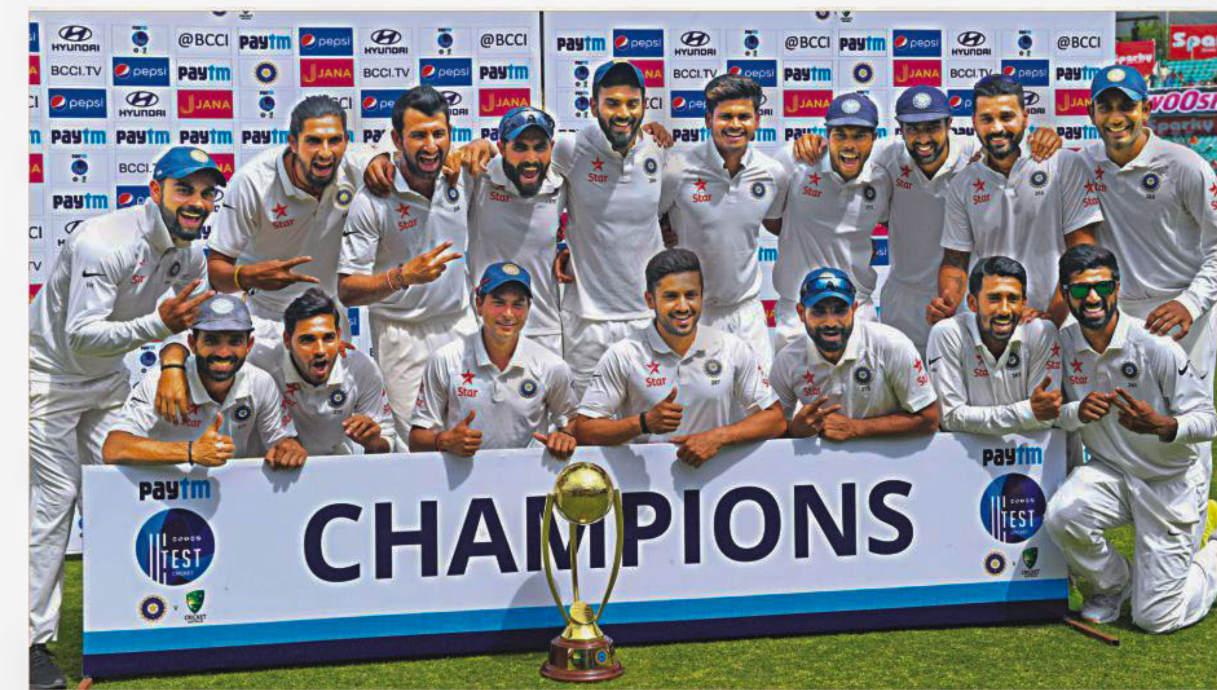
India players pose with the Border-Gavaskar trophy after winning the fourth and final Test against Australia in Dharamsala yesterday.