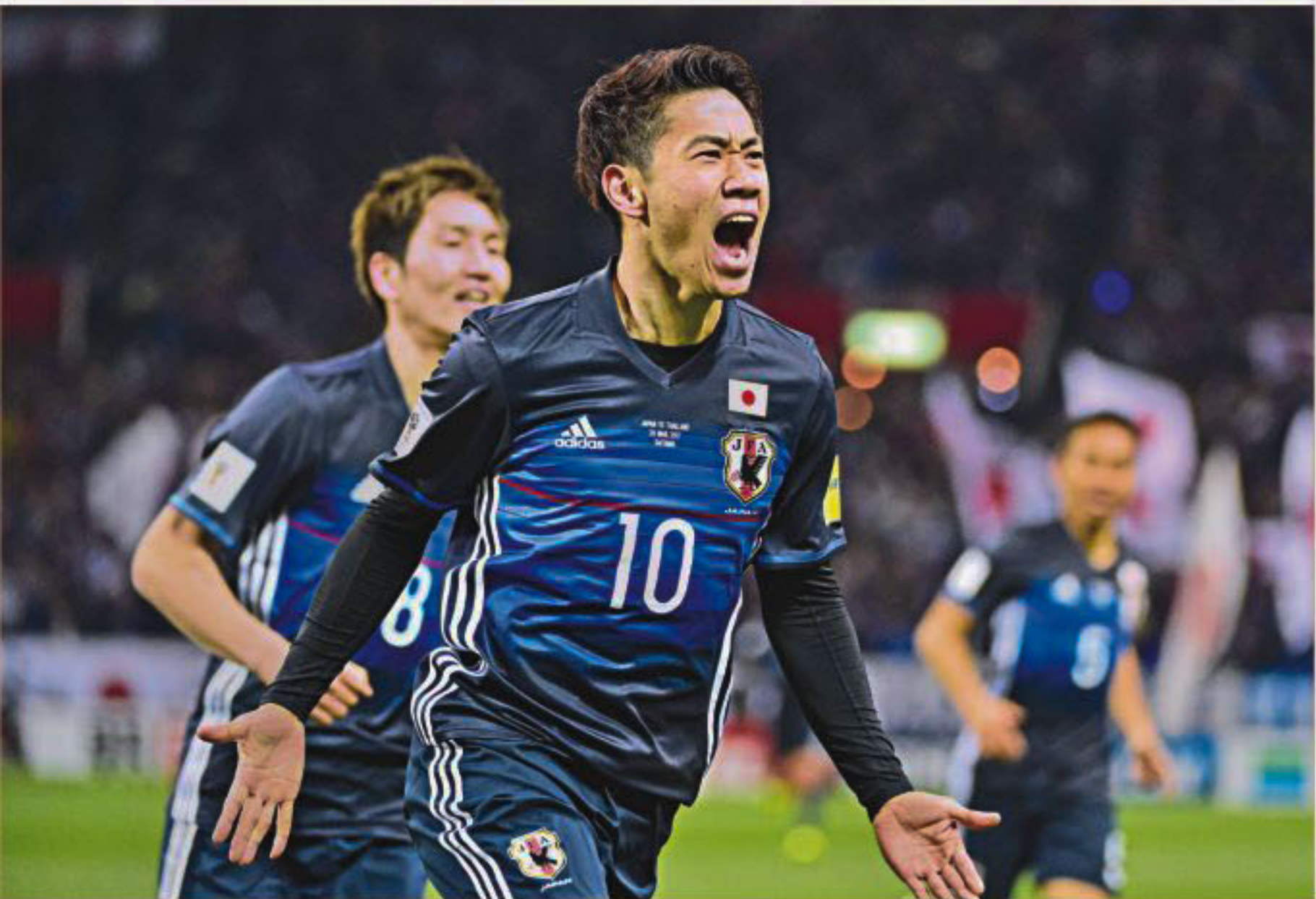
Japan forward Shinji Kagawa is ecstatic after his goal against Thailand during their 2018 World Cup qualifier in Saitama yesterday.