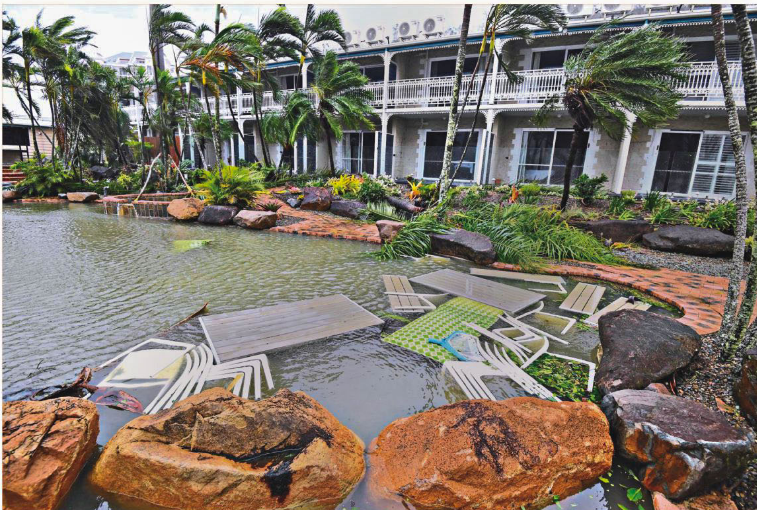
Outdoor furniture lies in a pool at a motel as Cyclone Debbie hits the northern Queensland town of Airlie Beach, located south of Townsville in Australia, yesterday. Police said one man was badly hurt when a wall collapsed at Proserpine and was taken to hospital.