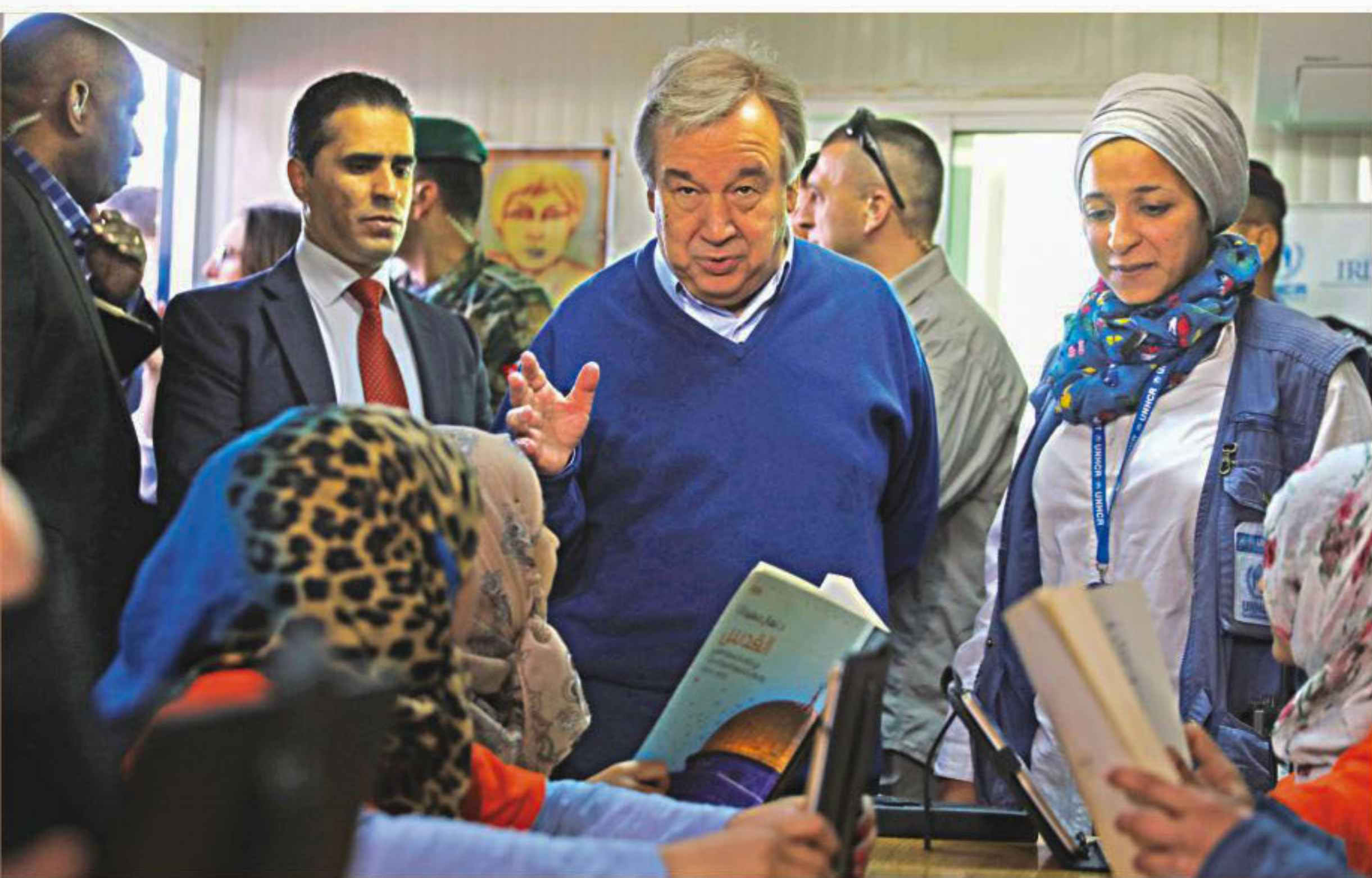
United Nations Secretary General Antonio Guterres speaks to Syrian children during his visit to Al Zaatari refugee camp in the Jordanian city of Mafraq, near the border with Syria yesterday. Guterres called on Arab leaders to set aside their differences to confront Syria's six-year conflict.