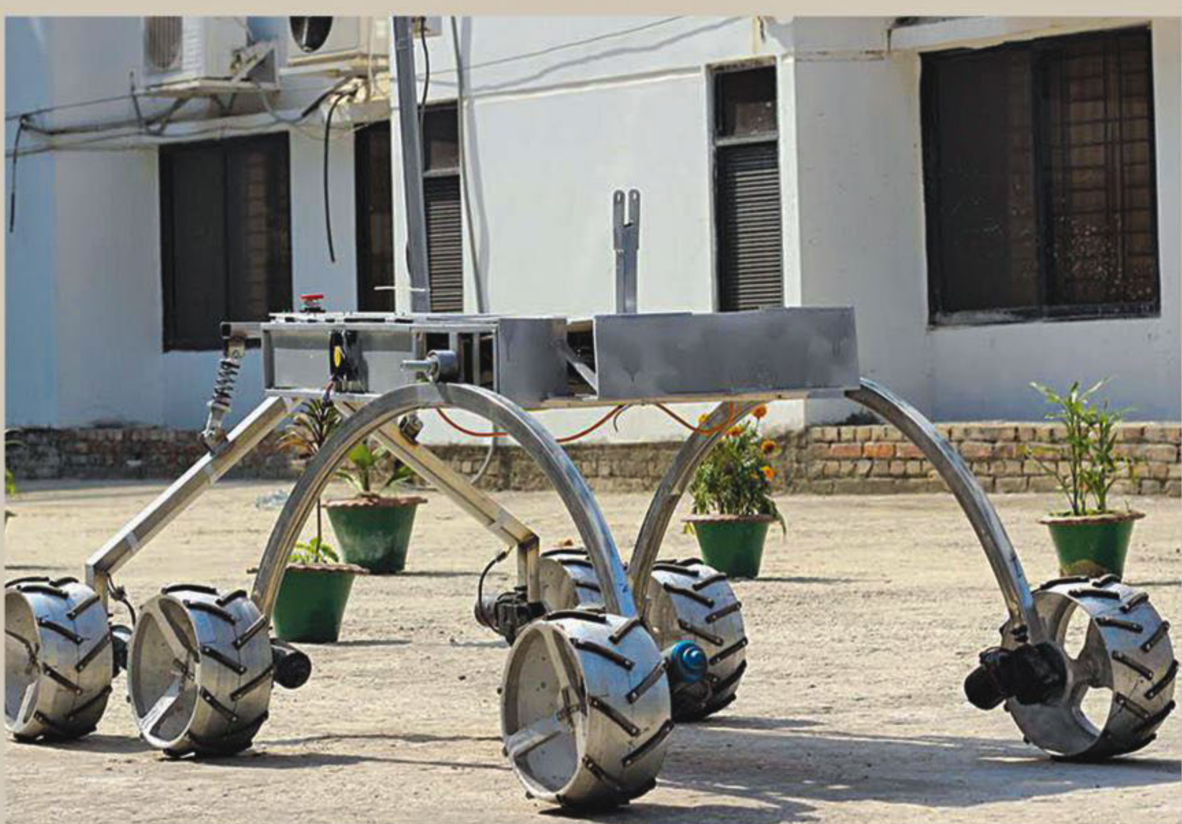
The Mars rover "Mongol Tori" designed and engineered by six students of Brac University. Six Bangladeshi universities will showcase mars rover vehicles developed by their students at the competition scheduled to take place at the Mars Desert Research Station in Utah, USA on June 1-3.