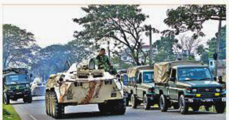
Troops returning to cantonment.