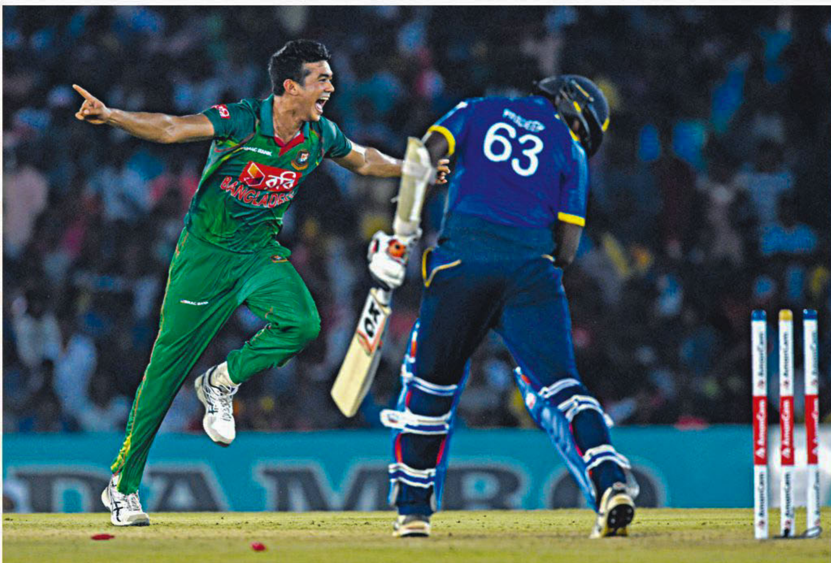
Taskin Ahmed became the fifth Bangladesh bowler to take an ODI hatrick, picking up three wickets on the trot in the last over of Sri Lanka's innings in the second ODI at the Rangiri Dambulla International Stadium yesterday.