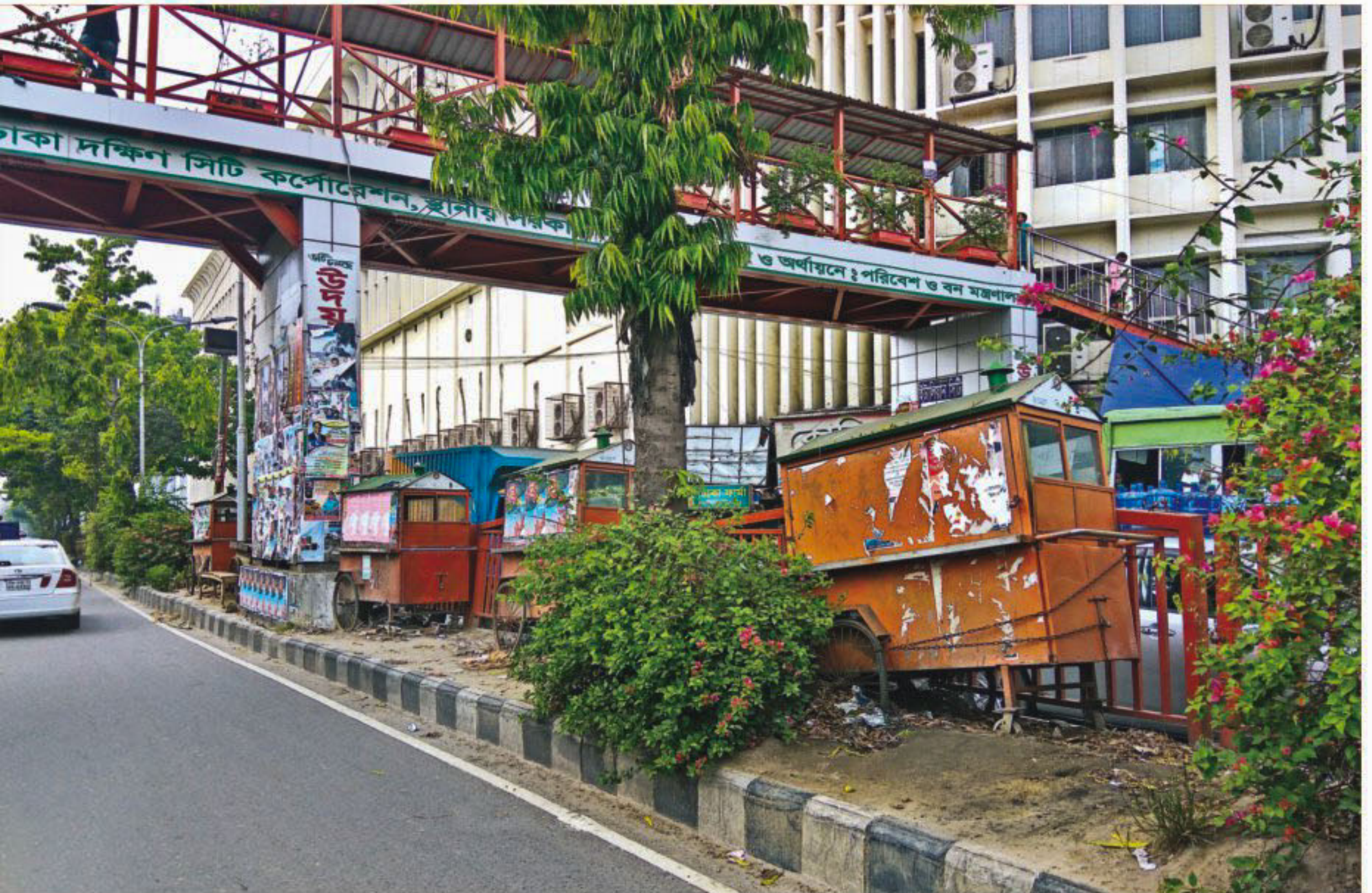
Food carts distributed by the Dhaka South City Corporation lie abandoned at the median strip of the road at Shahbagh in the capital yesterday. One year ago, in April 2016, DSCC distributed 80 such carts to as many trained vendors to ensure safe street food. The carts were provided by the UN Food and Agriculture Organization (FAO) as part of its "Safe Food" programme.