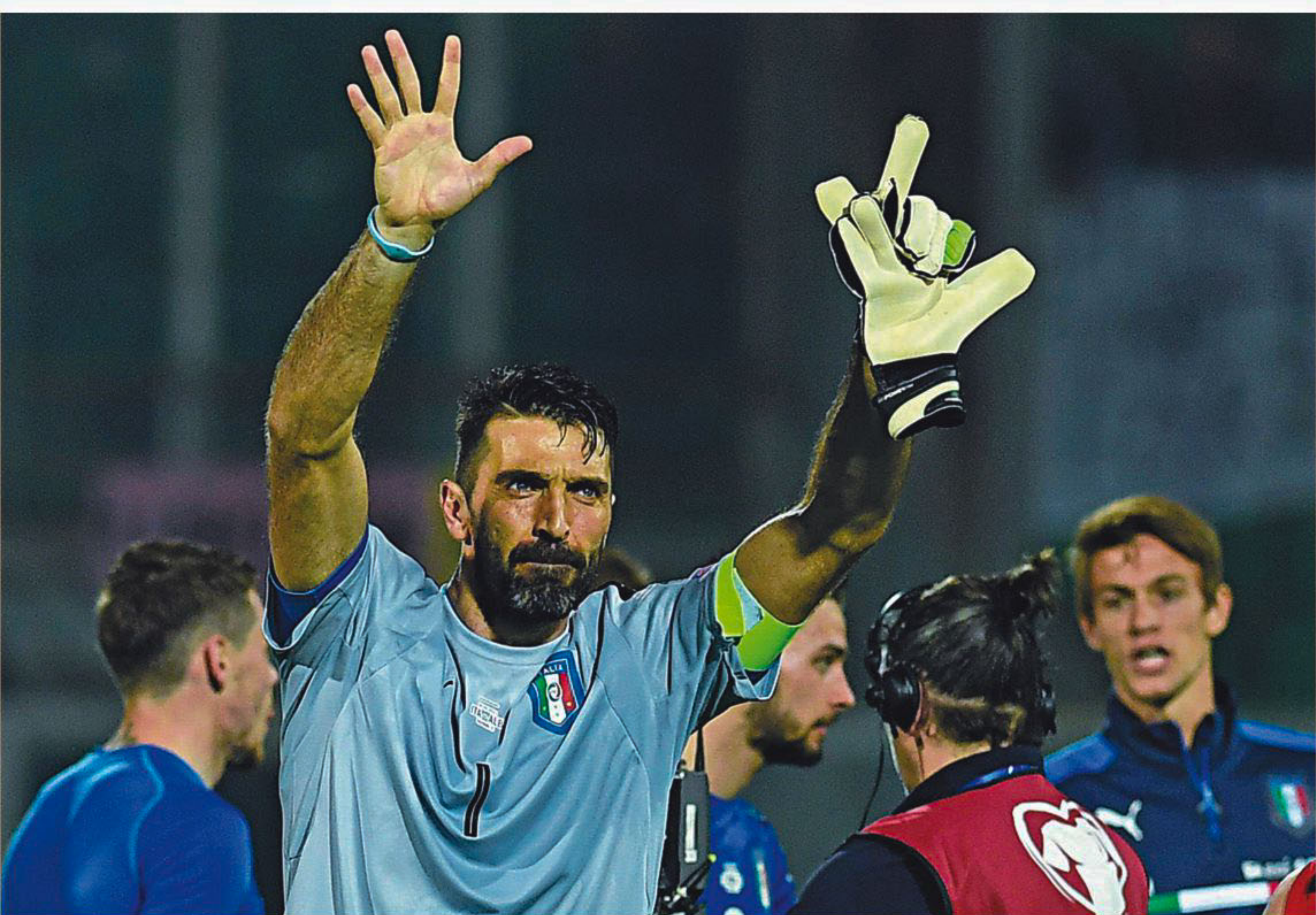
Italy captain Gianluigi Buffon marked a landmark 1,000th appearance in professional football by keeping his 426th clean sheet during Friday's 2018 World Cup qualifying match against Albania.