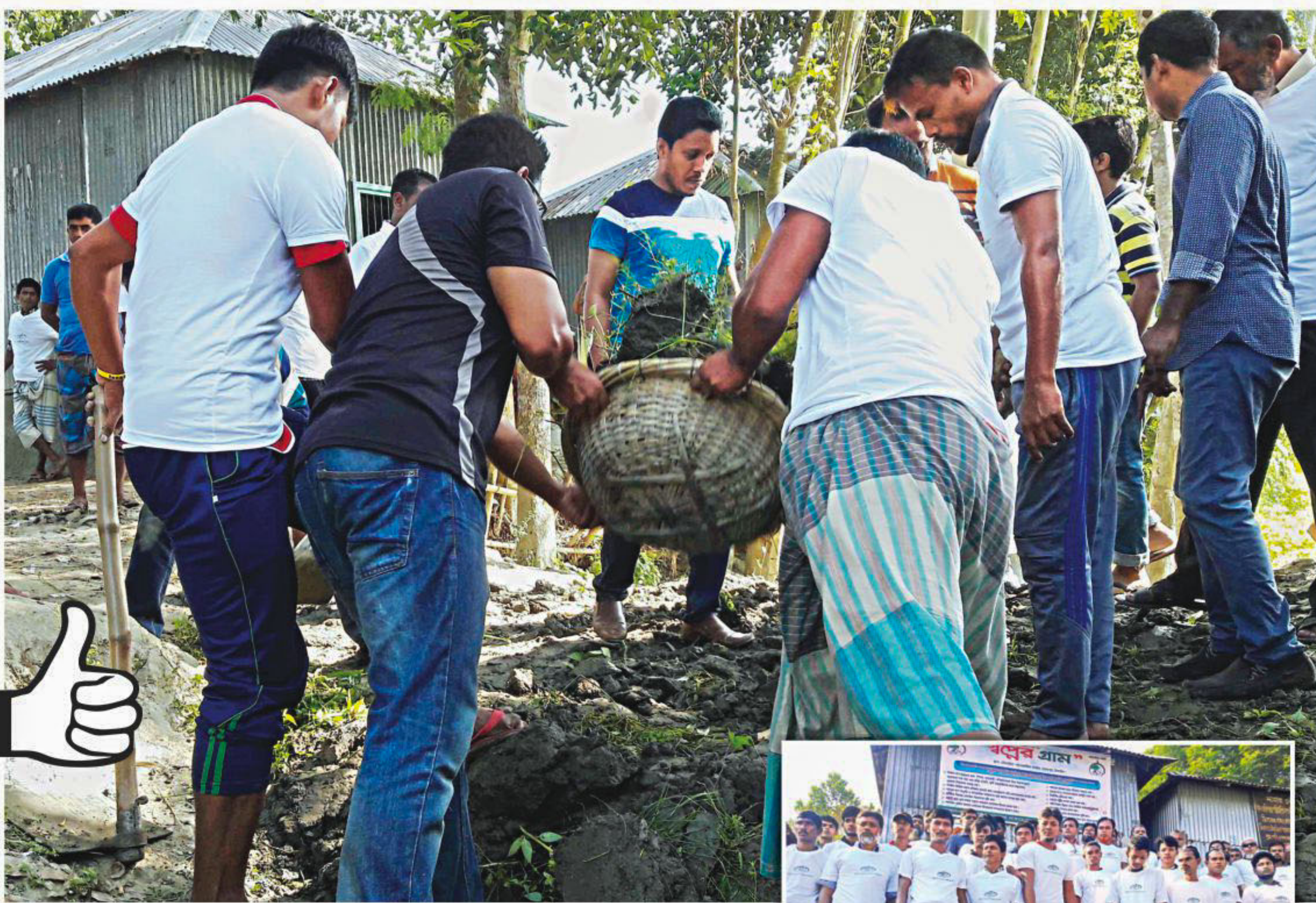
Volunteers of Sopner Gram (Dream Village) repairing a road in Nagarpur upazila of Tangail. The youths of the area formed the Sopner Gram organisation, inset, at Choubaria Panchsaratia Bazar to overcome social and infrastructure problems.