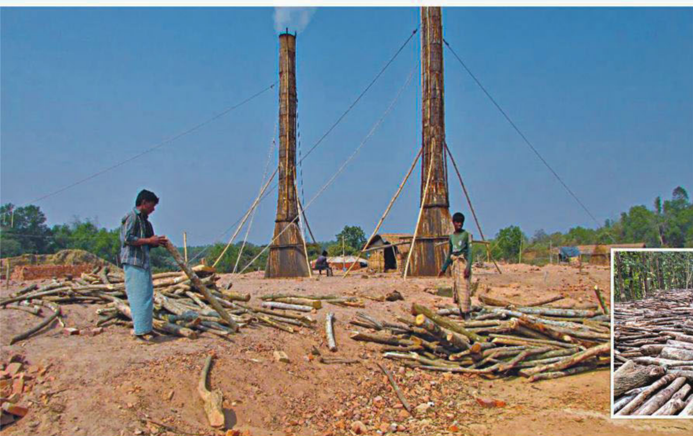
Defying government bans, a brick kiln burns logs to make bricks at Kagojikhola in Naikkhangchhari of Bandarban and uses chimneys that are shorter than the minimum height set by the government. Inset, stockpile of illegally felled forest trees for making the bricks.